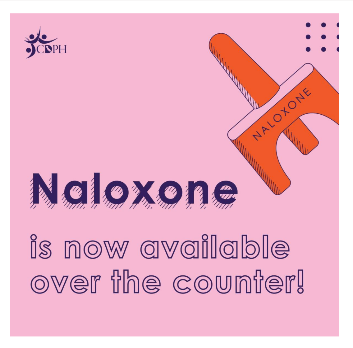
Naloxone Available Over the Counter

Naloxone is a medication that can save lives by reversing an opioid overdose. The brand name of Narcan can now be purchased over the counter, without a prescription.