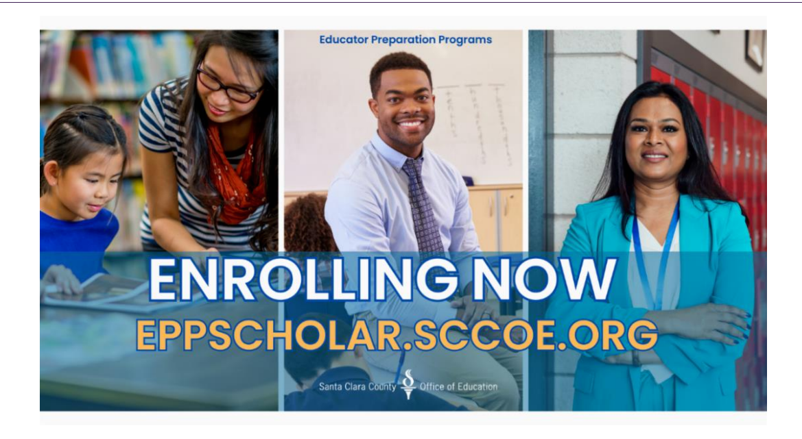
Educator Preparation Program (EPP)

The SCCOE's Educator Preparation Program (EPP) is seeking applications for programs listed below: