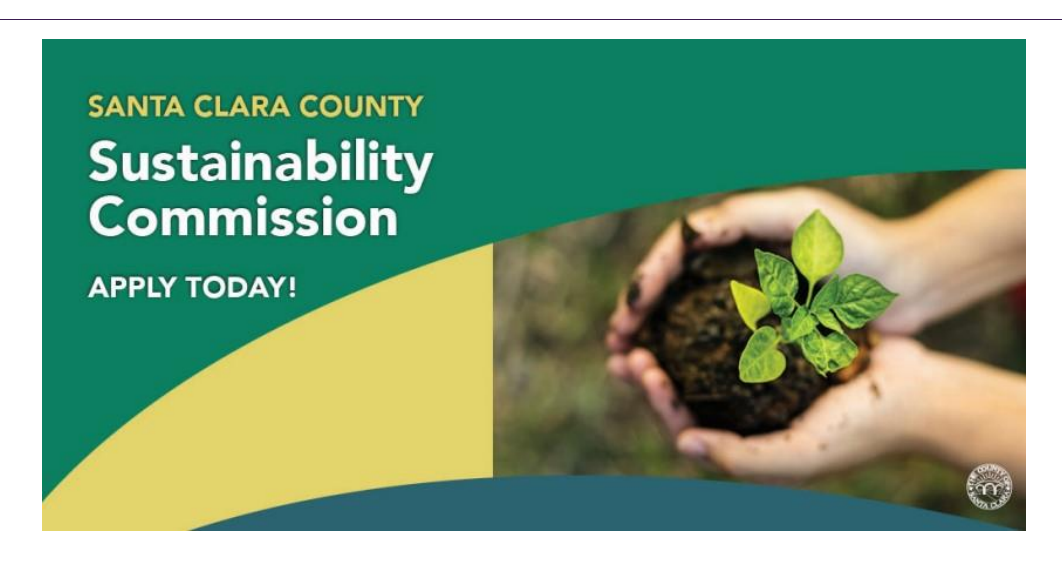
Sustainability Commission Youth Recruitment

The County of Santa Clara is recruiting two youth advocates for the Santa Clara County Sustainability Commission. In this role, you will help provide guidance on the County's efforts around climate change and sustainability. Youth ages 14 to 22 are encouraged to apply.