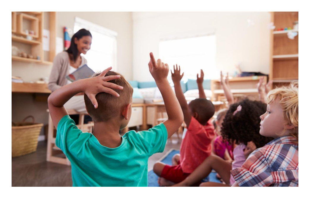
Spanish Story Time

To learn more or register, visit: www.sccoe.org/jobfair