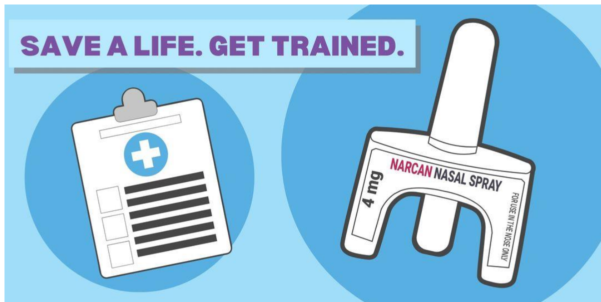
Opioid Overdose Presentation