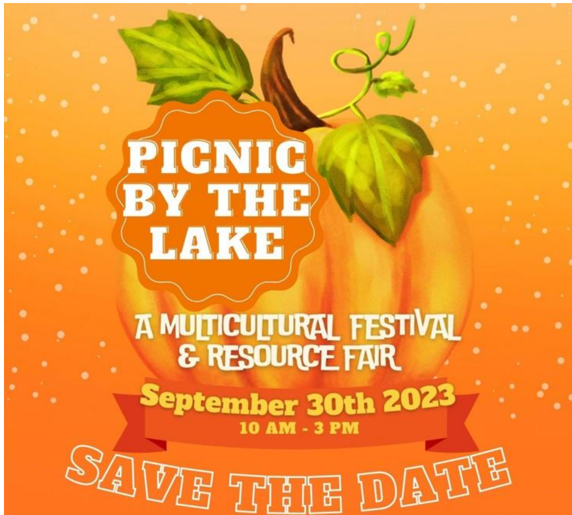
Picnic by the Lake

There is a cost associated with this event*