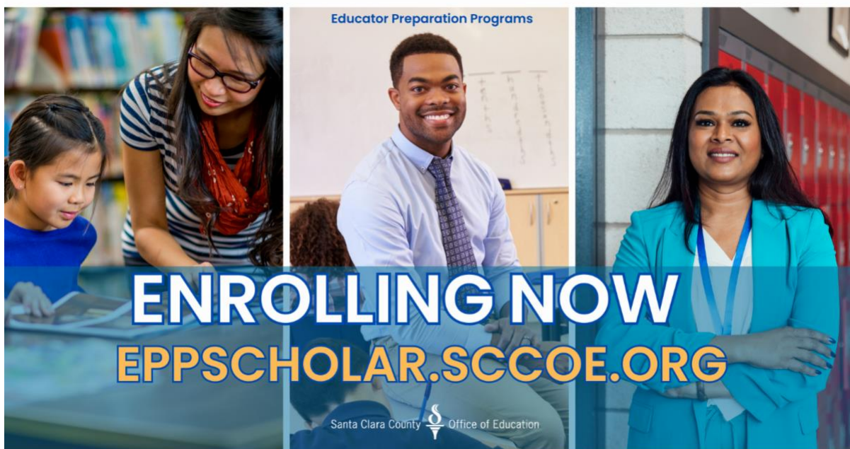
Educator Preparation Program

To learn more or register, visit: https://na.eventsccloud.com/ereg/index.php?eventid=754247&&