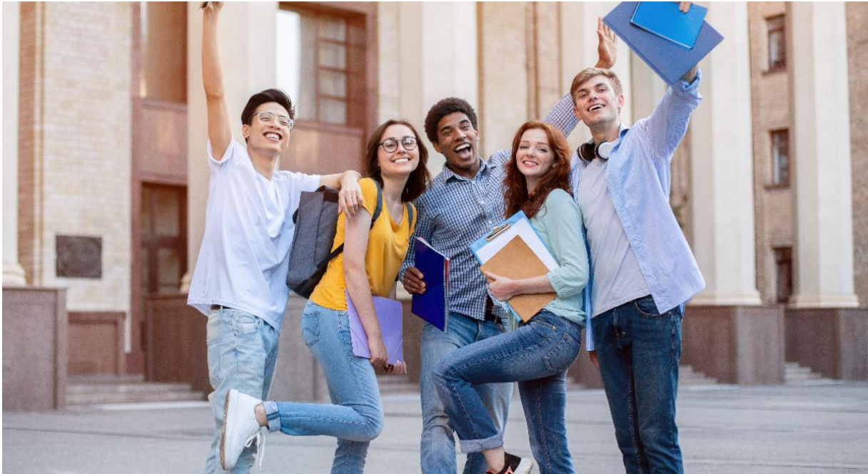
The Gates Scholarship

The Gates Scholarship is a scholarship for minority high school seniors from low-income households to help lower the barriers for youth dedicated to attending college. The scholarship is for student leaders to help them maximize their potential by attending university. The deadline to apply is September 15.