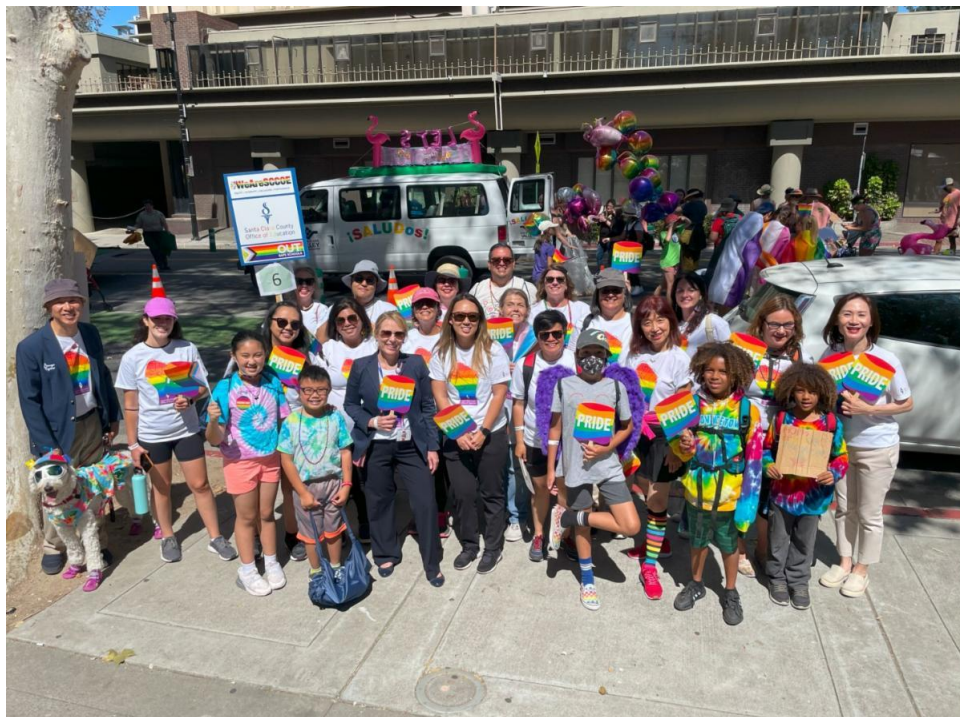
Silicon Valley Pride

To learn more or apply, visit: https://www.thegatesscholarship.org/