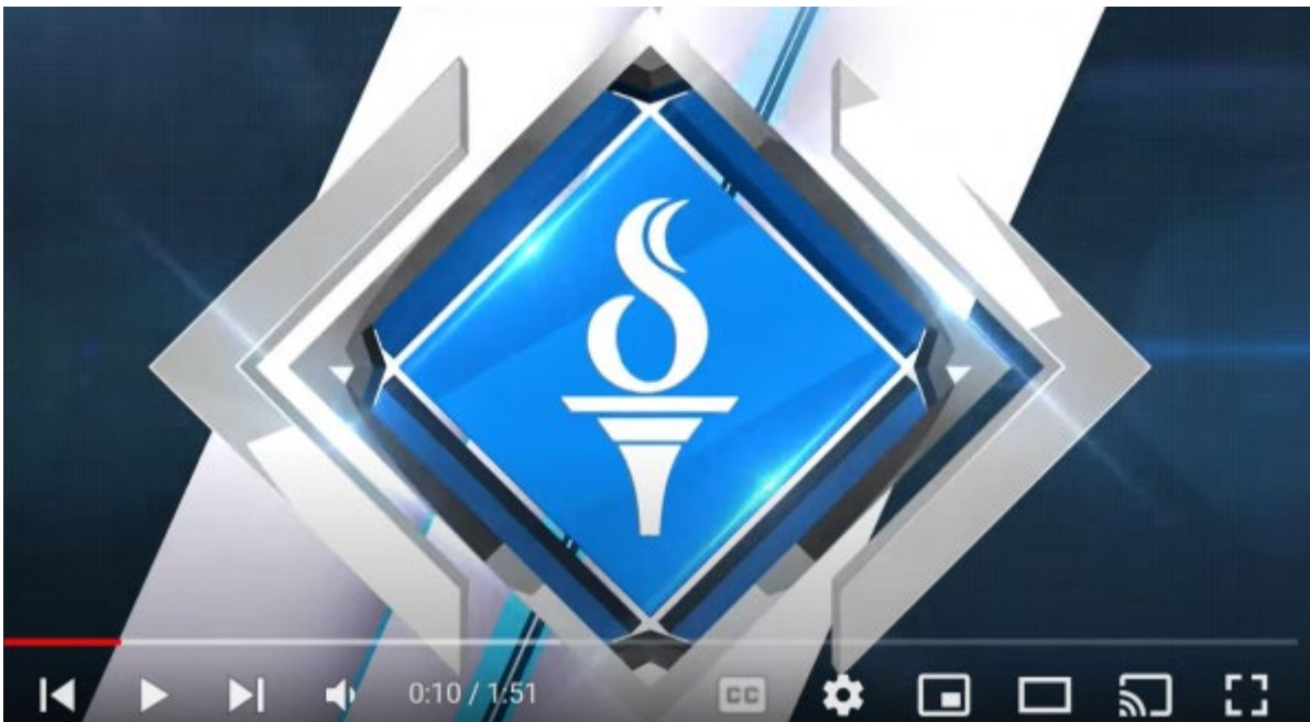
SCCOE News Minute

Visit the SCCOE Newsroom for the latest news and updates.