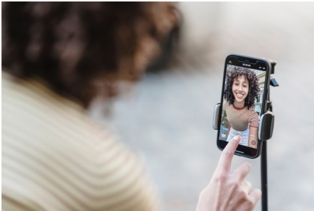
Viral Video Contest

The County of Santa Clara Public Health Department's Sexual Health & Harm Reduction Program is happy to announce the launch of the 2023 Viral Video Contest this month for Santa Clara County high school-age youth. According to the CDC, 1 in 2 sexually active youth will get an STI by age 25 and most will not know it. This is an exciting opportunity for Santa Clara County high school students to address this staggering statistic by creating a short video (30-90 seconds) that addresses stigma around STIs and testing, encourages safer sexual practices, and promotes healthy relationships. Winning students will be