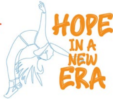
Young Artist Showcase

The Santa Clara County Office of Education announces the 2023 Young Artist Showcase. This showcase is open to public school students, grades pre-kindergarten through 12th grade, in Santa Clara County. Some students will have their artwork accepted into the permanent exhibit of student artwork located within the SCCOE campuses as well as showcased at the virtual Young Artist Showcase Celebration on May 9, 2023, celebrating Arts Education Month in California.