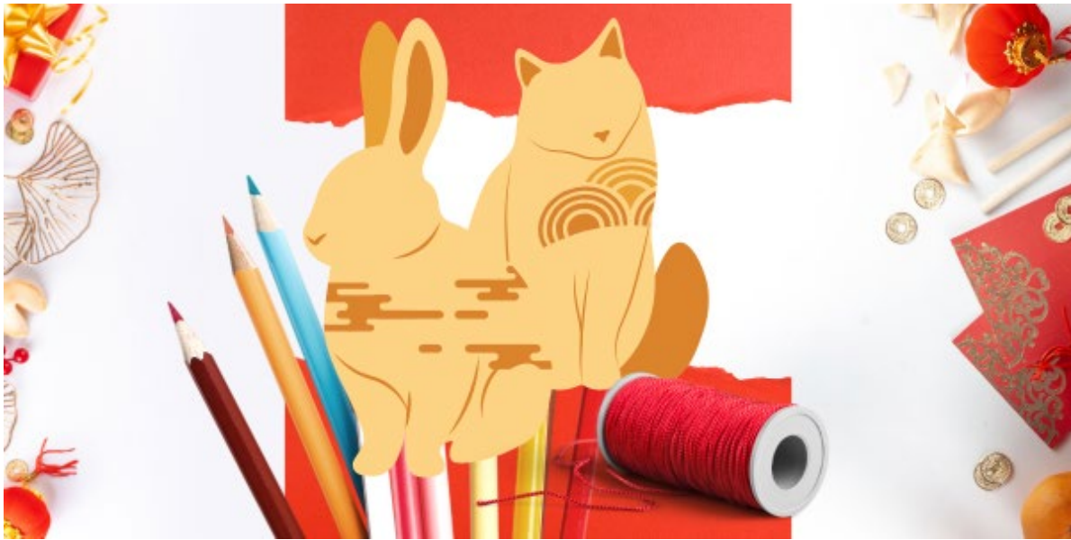
Lunar New Year

The San Jose Public Library will host a variety of activities to celebrate the Lunar New Year. To see a list of activities at a library branch near you, visit the SJPL website at https://sjpl.bibliocommons.com/v2/events?q=lunar%20new%20year