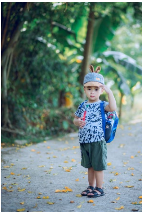
Transitional Kindergarten Webinar

CalKIDS is a state program that gives children in California a jump start on saving for college. Newborns and eligible low-income public school students are automatically enrolled and given a CalKIDS college savings account with an initial deposit. Eligible participants are identified by data received from the California Department of Public Health and the California Department of Education. There is no need to apply and no requirement that families make any kind of financial commitment. Find more information at https://calkids.org/the-basics/