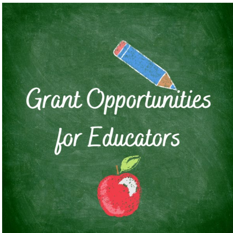
Monthly Grant Opportunities