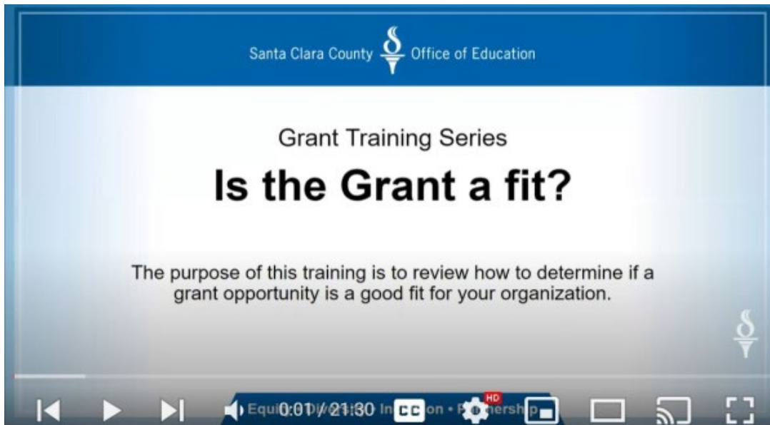
Grant Training Series

The SCCOE's Grants, Partnerships, and Operations Department has developed a Grant Training Series providing short training videos on a variety of grant writing topics to support school and community members in writing grants. Please visit the SCCOE GPO YouTube playlist to see these videos and past videos.