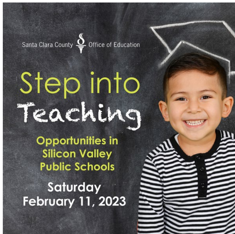
Pursue a teaching career

To submit artwork, visit https://sccoe.to/YAS2023SubmissionForm For more information, visit https://www.sccoe.org/arts/yas