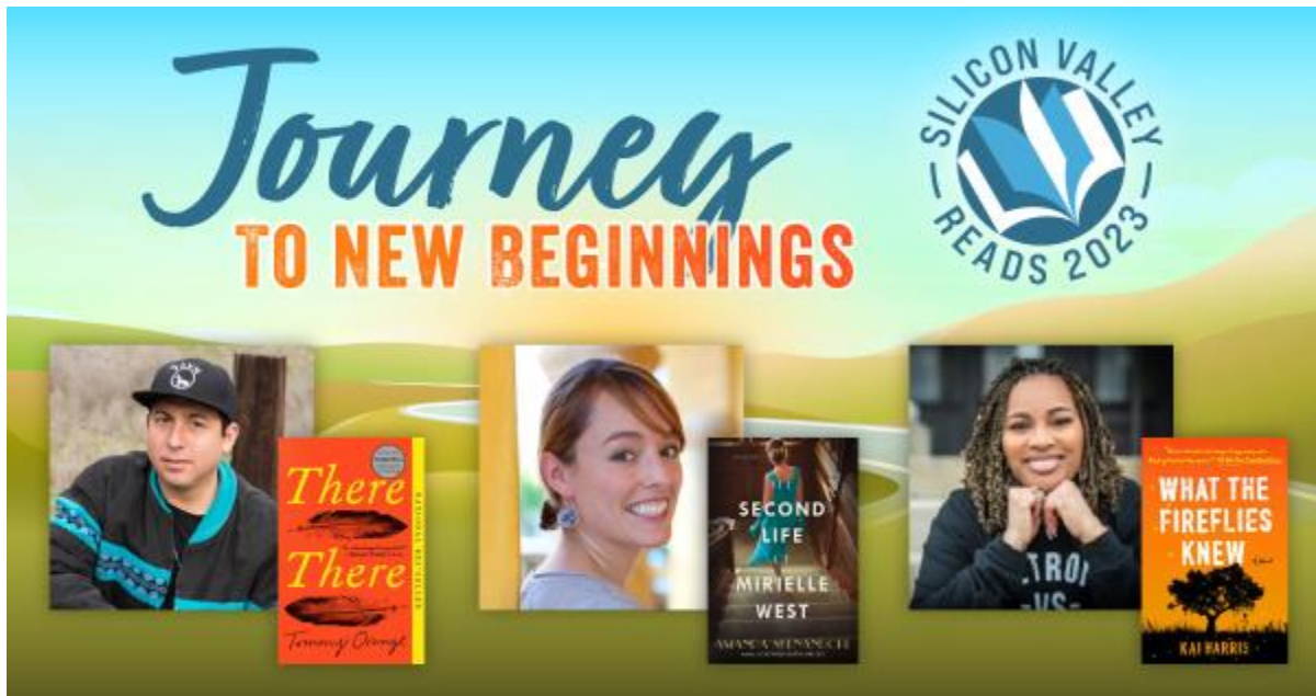
Silicon Valley Reads Kickoff