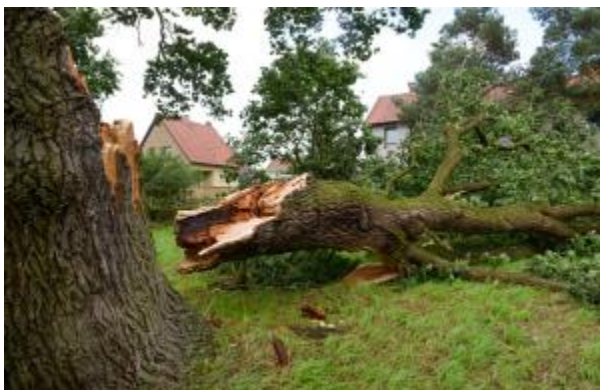
Safety tips during storms

Never drive into flooded areas. In a disaster, the road to safety may not be your usual route. Disasters may close roads and bus routes you usually take. Check your local weather forecast and sign up for alerts at CalAlerts.org . Check road conditions using the Caltrans QuickMap .