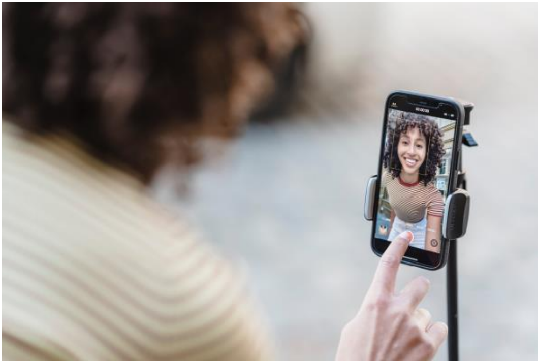
Viral Video Contest

The County of Santa Clara Public Health Department's Sexual Health & Harm Reduction Program is happy to announce the launch of the 2023 Viral Video Contest this month for Santa Clara County high school-age youth. According to the CDC, 1 in 2 sexually active youth will get an STI by age 25 and most will not know it. This is an exciting opportunity for Santa Clara County high school students to address this staggering statistic by creating a short video (30-90 seconds) that addresses stigma around STIs and testing, encourages safer sexual practices, and promotes healthy relationships. Winning students will be awarded up to $1,500 for themselves and $500 for their high school. The submission deadline is March 12, 2023.