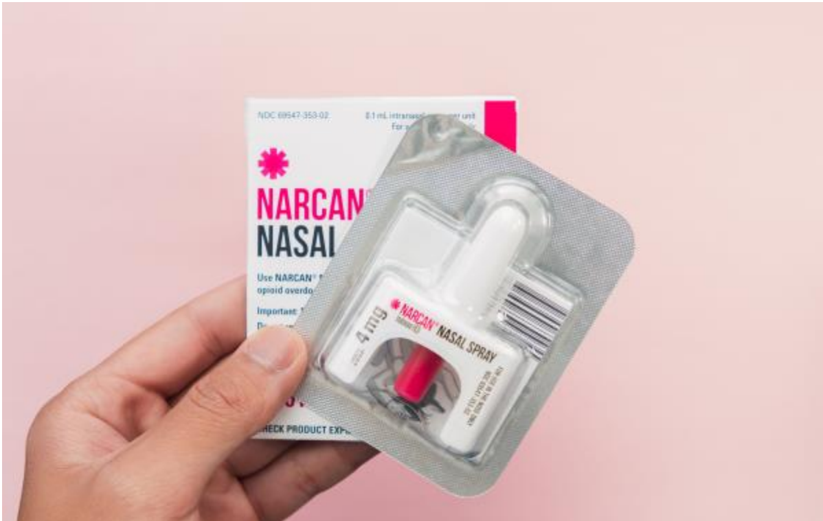
Naloxone Training and Distribution Community Event

In support of the public health response to opioid-related overdose deaths, the SCCOE, in collaboration with the Santa Clara County Behavioral Health Services and Santa Clara County Opioid Overdose Prevention Project (SCCOOPP), recently launched the Naloxone Training and Distribution Project. The project has established partnerships with schools to facilitate training to volunteer school staff and community members on the emergency administration of naloxone and distribute free Narcan kits to schools and at community events.