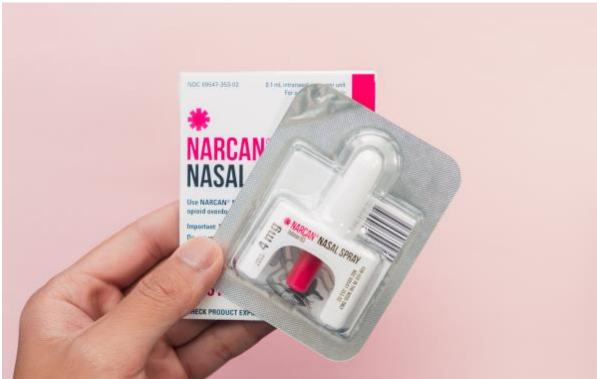
Naloxone Training and Distribution Community Event

In support of the public health response to opioid-related overdose deaths, the SCCOE, in collaboration with the Santa Clara County Behavioral Health Services and Santa Clara County Opioid Overdose Prevention Project (SCCOOPP), recently launched the Naloxone Training and Distribution Project. The project has established partnerships with schools to facilitate training to volunteer school staff and community members on the emergency administration of naloxone and distribute free Narcan kits to schools and at community events.