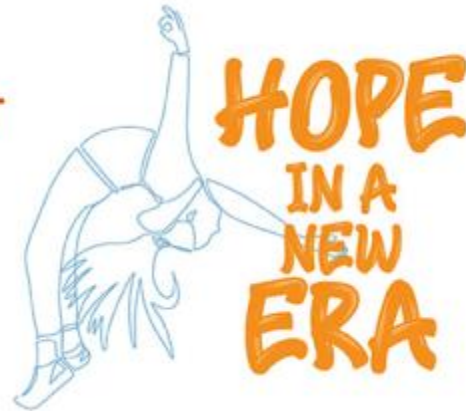
Young Artist Showcase

The Santa Clara County Office of Education announces the 2023 Young Artist Showcase. This showcase is open to public school students, grades Pre-kindergarten through 12th grade, in Santa Clara County. Some students will have their artwork accepted into the permanent exhibit of student artwork located within the SCCOE campuses as well as showcased at the virtual Young Artist Showcase Celebration on May 9, 2023, celebrating Arts Education Month in California.