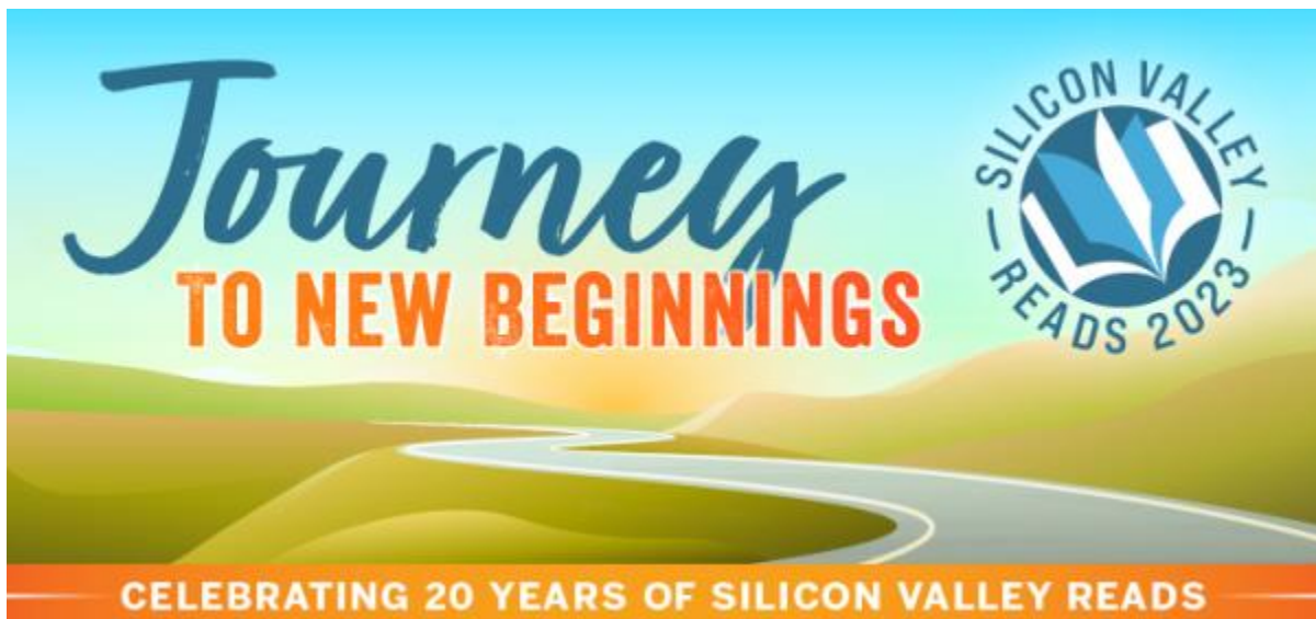
Silicon Valley Reads Kickoff

Winter Reading will run from January 1 - January 31, 2023, with pre-registration from December 12-31, 2022. Children, teens, adults and families can all sign up on their own, or they can sign up under one big group as part of a class, book club or other large party. All who participate are eligible to win fun and exciting prizes. Local educators are encouraged to pre-register their class(es) between December 12 - 31, 2022 and get ready to read and learn together as a group. For more details, visit https://www.sjpl.org/winter