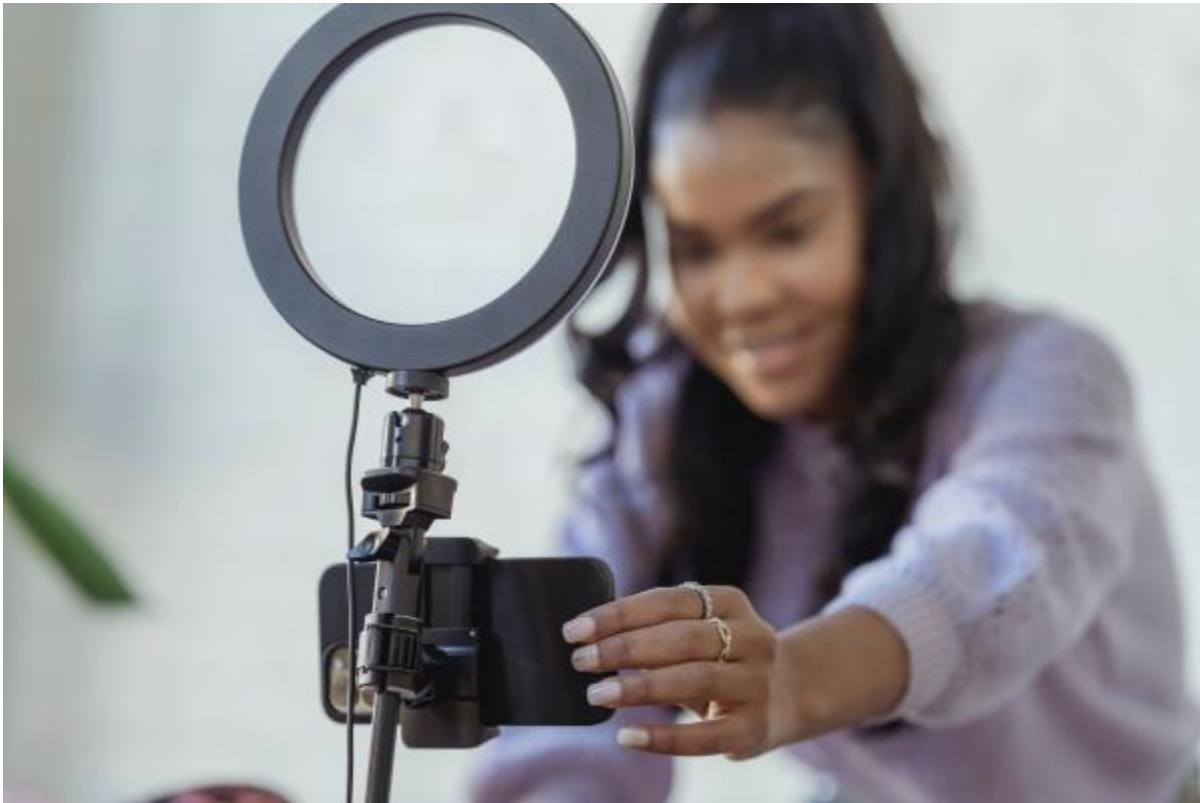
Viral Video Contest

The County of Santa Clara Public Health Department's Sexual Health & Harm Reduction Program is happy to announce the launch of the 2023 Viral Video Contest this month for Santa Clara County high school-age youth. According to the CDC, 1 in 2 sexually active youth will get an STI by age 25 and most will not know it. This is an exciting opportunity for Santa Clara County high school students to address this staggering statistic by creating a short video (30-90 seconds) that addresses stigma around STIs and testing, encourages safer sexual practices, and promotes healthy relationships. Winning students will be awarded up to $1,500 for themselves and $500 for their high school. The submission deadline is March 12, 2023.