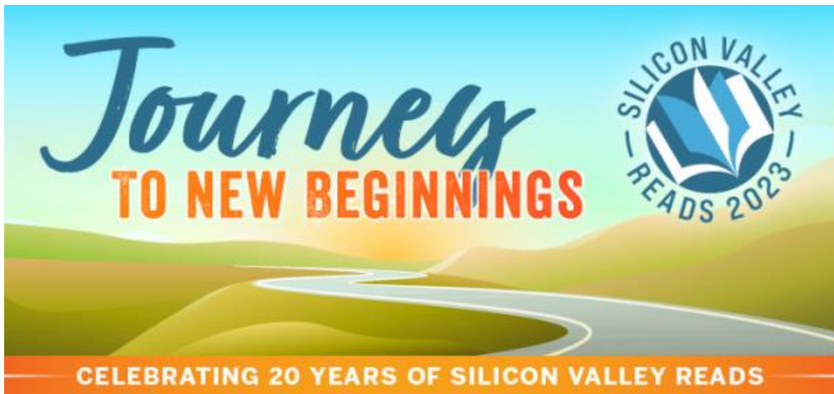
Silicon Valley Reads Kickoff