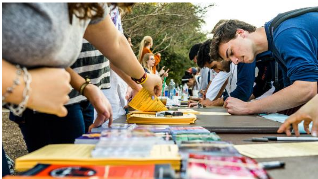
Apply to the Civic Learning Award