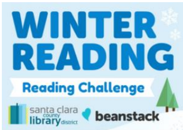
Winter Reading Challenge

Throughout December and January, explore booklists and activities all based around the frostiest time of year. Check out the Santa Clara Library District's booklists for adults , teens , and children , and find a winter read that appeals to you!