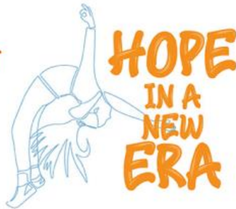
Young Artist Showcase

The Santa Clara County Office of Education announces the 2023 Young Artist Showcase. This showcase is open to public school students, grades Pre-kindergarten through 12th grade, in Santa Clara County. Some students will have their artwork accepted into the permanent exhibit of student artwork located within the SCCOE campuses as well as showcased at the virtual Young Artist Showcase Celebration on May 9, 2023, celebrating Arts Education Month in California.