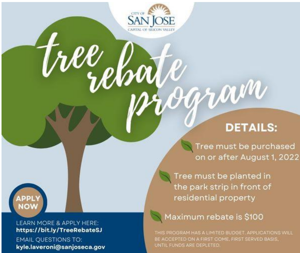
Tree Rebate Program

Help the City of San José replenish its urban tree canopy by planting a street tree and receive a rebate of up to $100 to cover the cost! Street trees don't just look good but are also linked with numerous health, safety, and financial benefits as well as providing valuable shade.