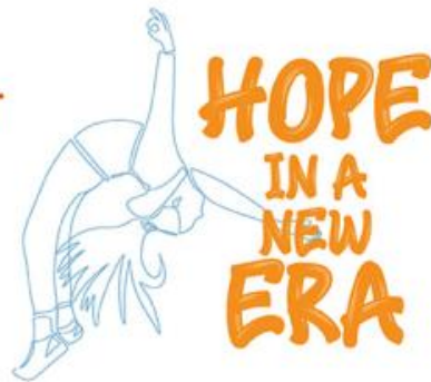
Young Artist Showcase

The Santa Clara County Office of Education announces the 2023 Young Artist Showcase. This showcase is open to public school students, grades Pre-kindergarten through 12th grade, in Santa Clara County. Some students will have their artwork accepted into the permanent exhibit of student artwork located within the SCCOE campuses as well as showcased at the virtual Young Artist Showcase Celebration on May 9, 2023, celebrating Arts Education Month in California.