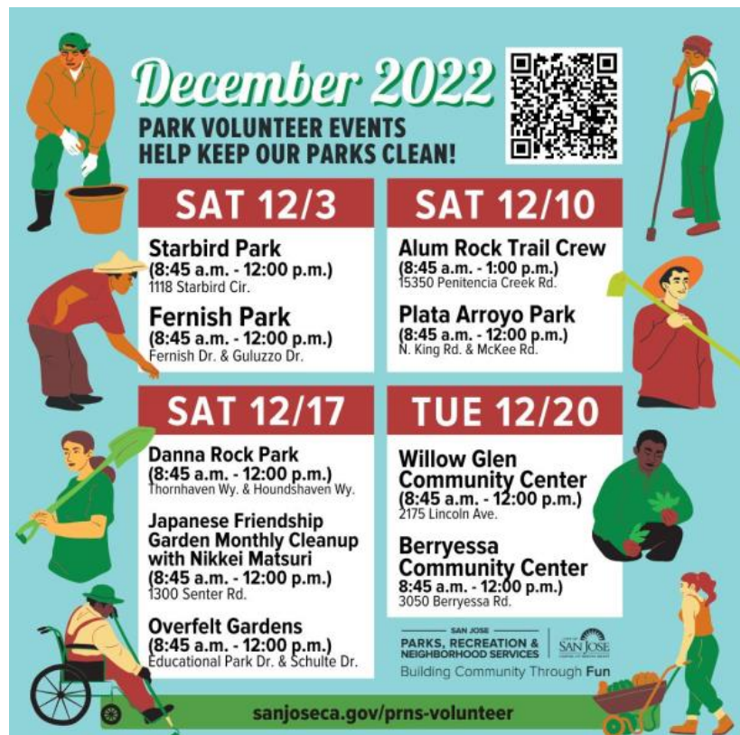
Park Volunteers Needed