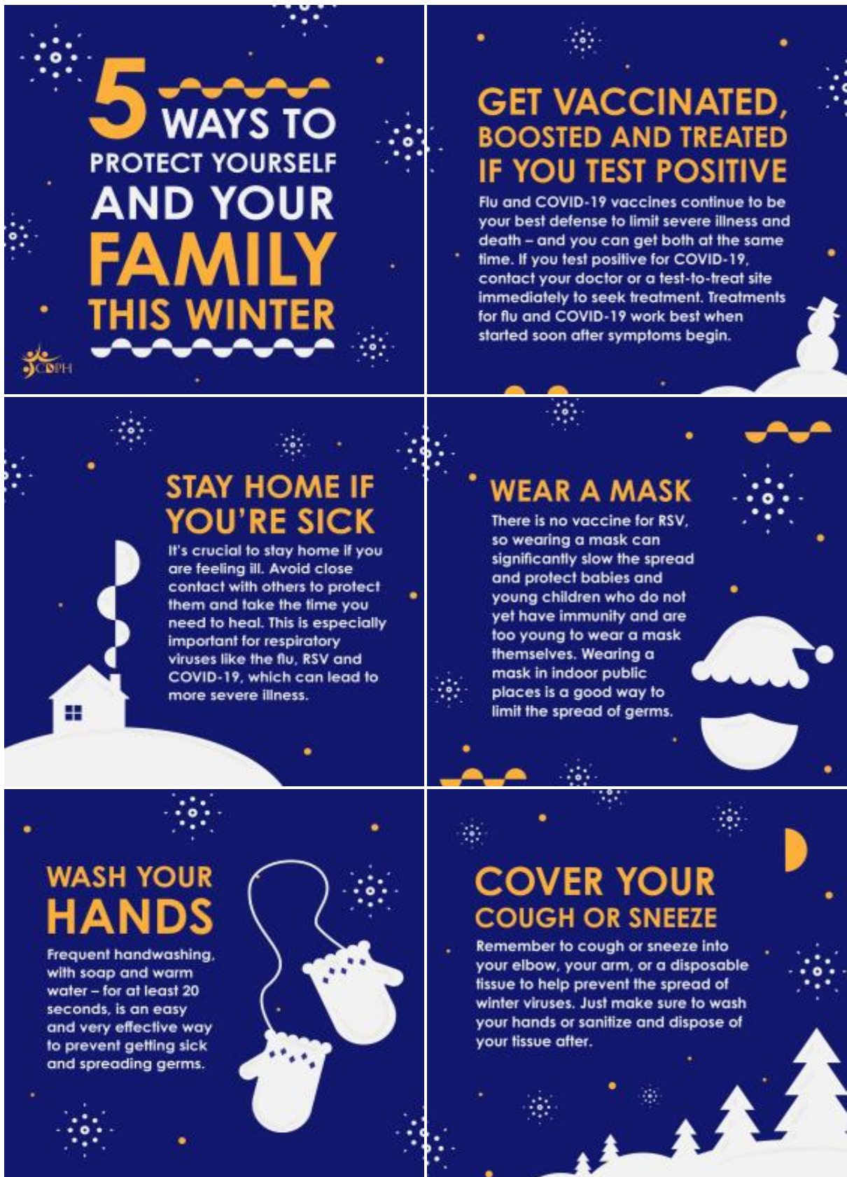
Stay Healthy this Winter

Winter virus season is here early, and pediatric hospitalizations are on the rise. This winter and the holiday gathering season, help protect yourself and the vulnerable (especially