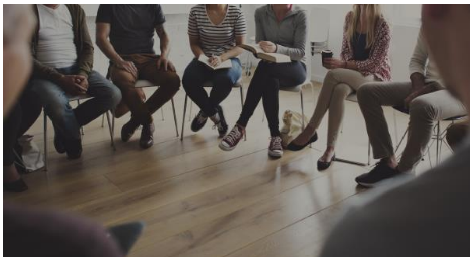
Support Groups Available

Need help with mental health or substance abuse? Join the County of Santa Clara Behavioral Health Services Department Mental Health & Substance Use Support Group at