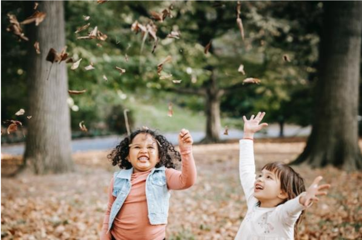
Strategies for a healthy fall

As the days get shorter and cooler and the seasons change, use these strategies from the CDC to help prevent chronic diseases and maintain a healthy lifestyle.