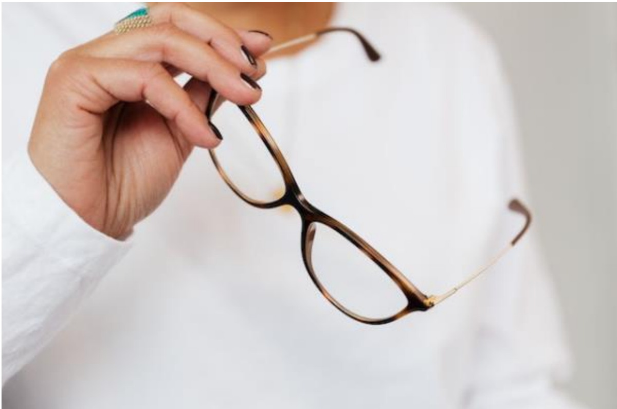
Glasses for those in need

Do you need help paying for new eyeglasses? New Eyes is a non-profit with a 90-year history of providing free prescription eyeglasses to individuals experiencing financial hardships. Learn more about eligibility requirements and how to apply at www.new-eyes.org .