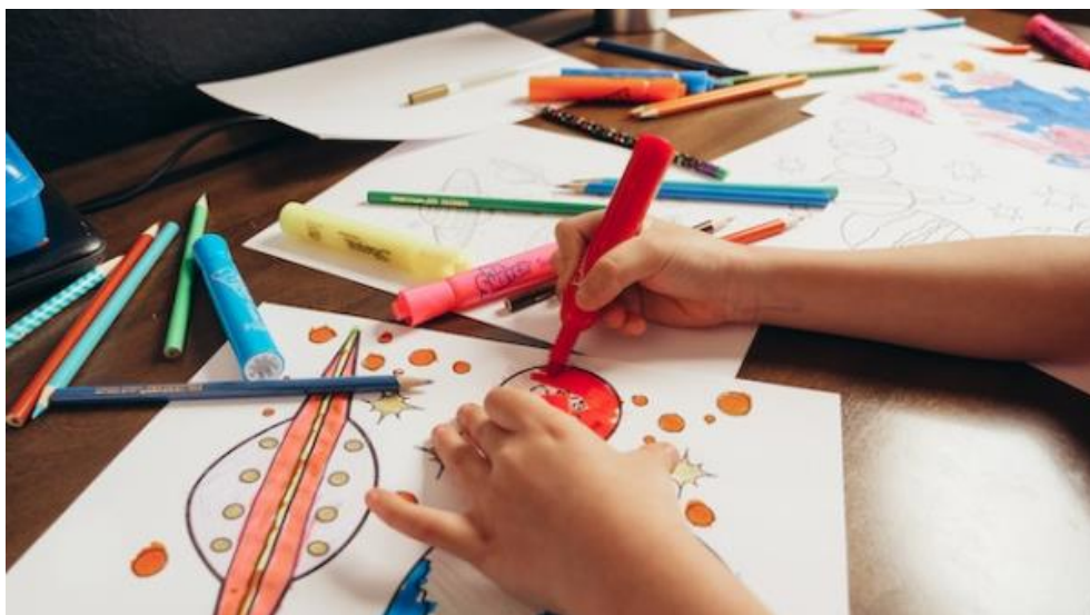
Virtual calming room

Babies under 6 months of age can't get a flu shot, but their families can. Help protect the youngest among us. Visit MyTurn.ca.gov to schedule your flu shot (as well as your COVID-19 booster) today.