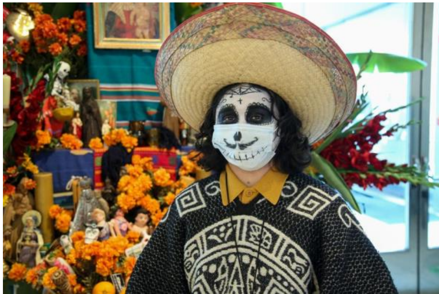
Community Day: Día de Los Muertos

Celebrate Día de Los Muertos (Day of the Dead) with a full day of live entertainment, cultural demonstrations, and an eclectic mix of artmaking experiences. Gather your family and friends for this annual festive event that has been a highlight of San Jose Museum of Art family programming for over twenty years. Join us as we collaborate with local artists, partners, and organizations for this truly intracultural and multigenerational event! Museum admission is free all day.