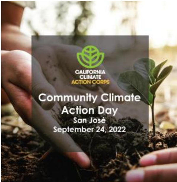
Volunteer on Community Climate Action Day