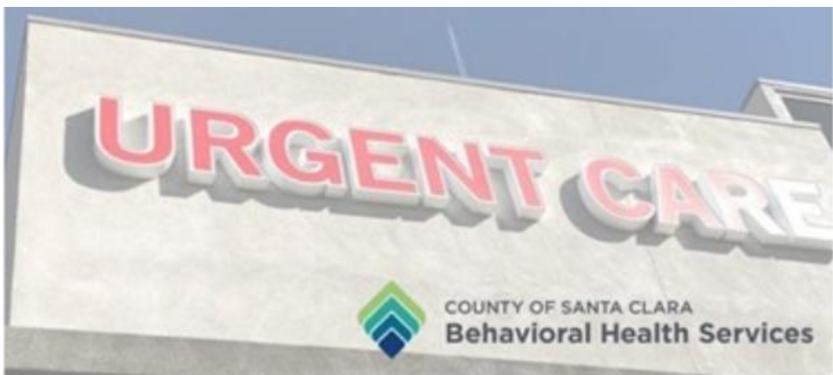
Mental Health Urgent Care

This guide can help you explore different fruits and vegetables throughout the year. Seasonal produce in your area will vary by growing conditions and weather. Remember, fresh, frozen, canned, and dried: fruits and vegetables are a delicious way to make every bite count!