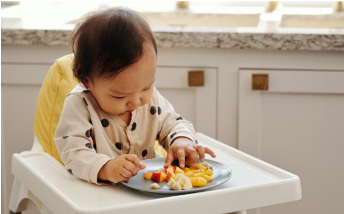
Seasonal fruits and veggies

students, families, and staff to find tools and strategies for managing emotions and feelings.