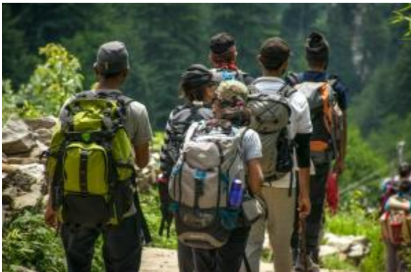
Outdoor Film Festival