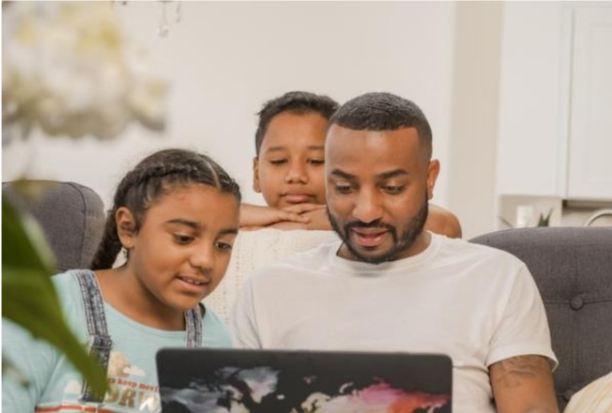
Parent Engagement Program

The Parent Engagement Program invites District Teams to participate in building sustainable and empowering parent and family engagement programs for effective family partnerships which impact student success. For details and registration, visit https://scoec.to/PEPFamilyEngagementCoP