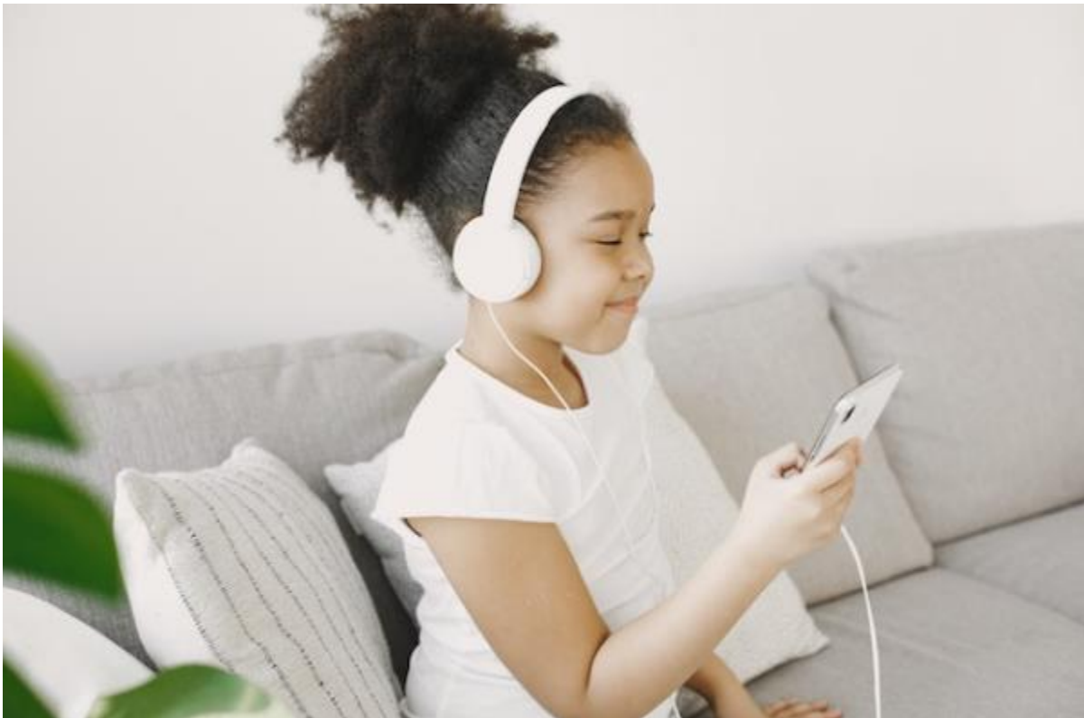
Virtual calming room

The Santa Clara County Office of Education is dedicated to supporting the mental health of K-12 students, staff, and the community. This virtual Calming Room is a resource for