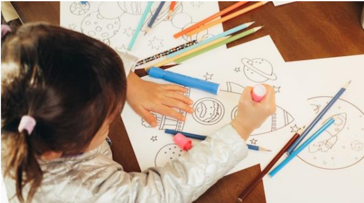
Free coloring pages from Crayola

The Parent Engagement Program invites District Teams to participate in building sustainable and empowering parent and family engagement programs for effective family partnerships which impact student success. For details and registration, visit https://scoec.to/PEPFamilyEngagementCoP