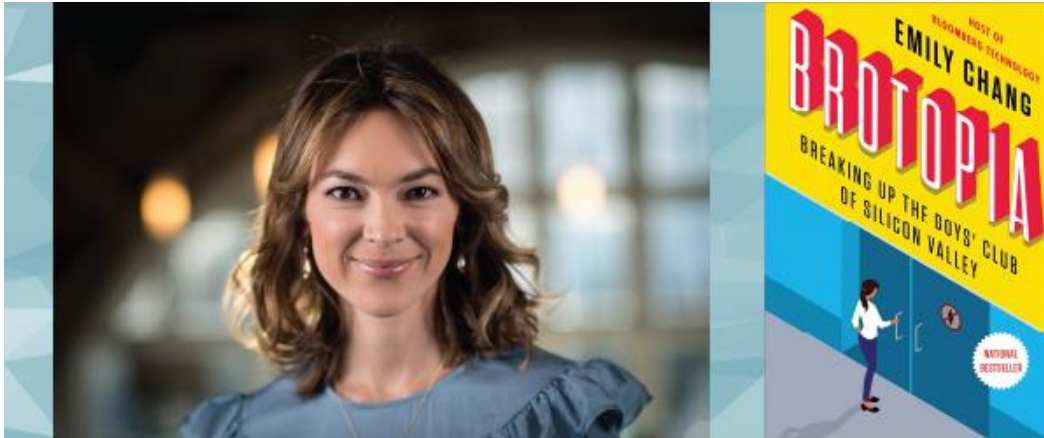
Distinguished Author Series