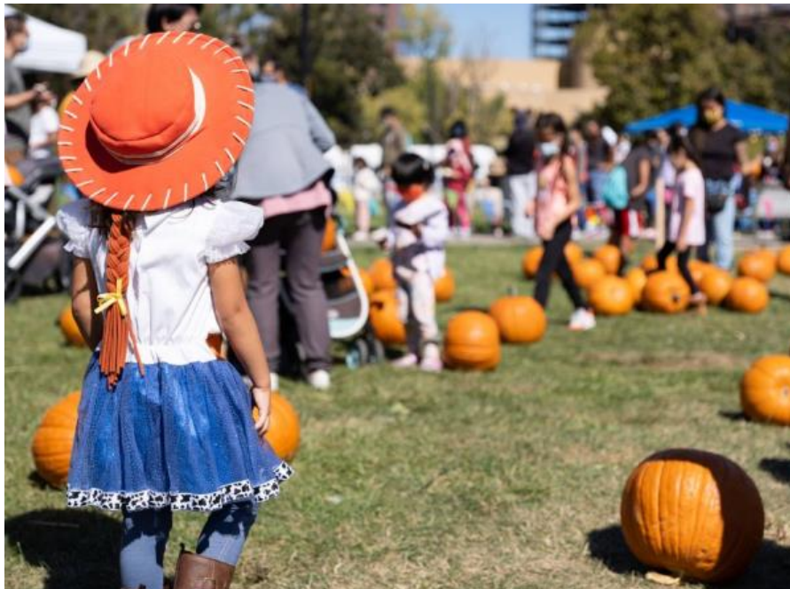
Pumpkins in the Park

The Santa Clara County Library District's Distinguished Author Series Kicks Off with Emmy-winning journalist Emily Chang on Wednesday, September 14 at the Campbell Heritage Theatre at 7 p.m. For more details, visit https://scclid.org/authorseries/