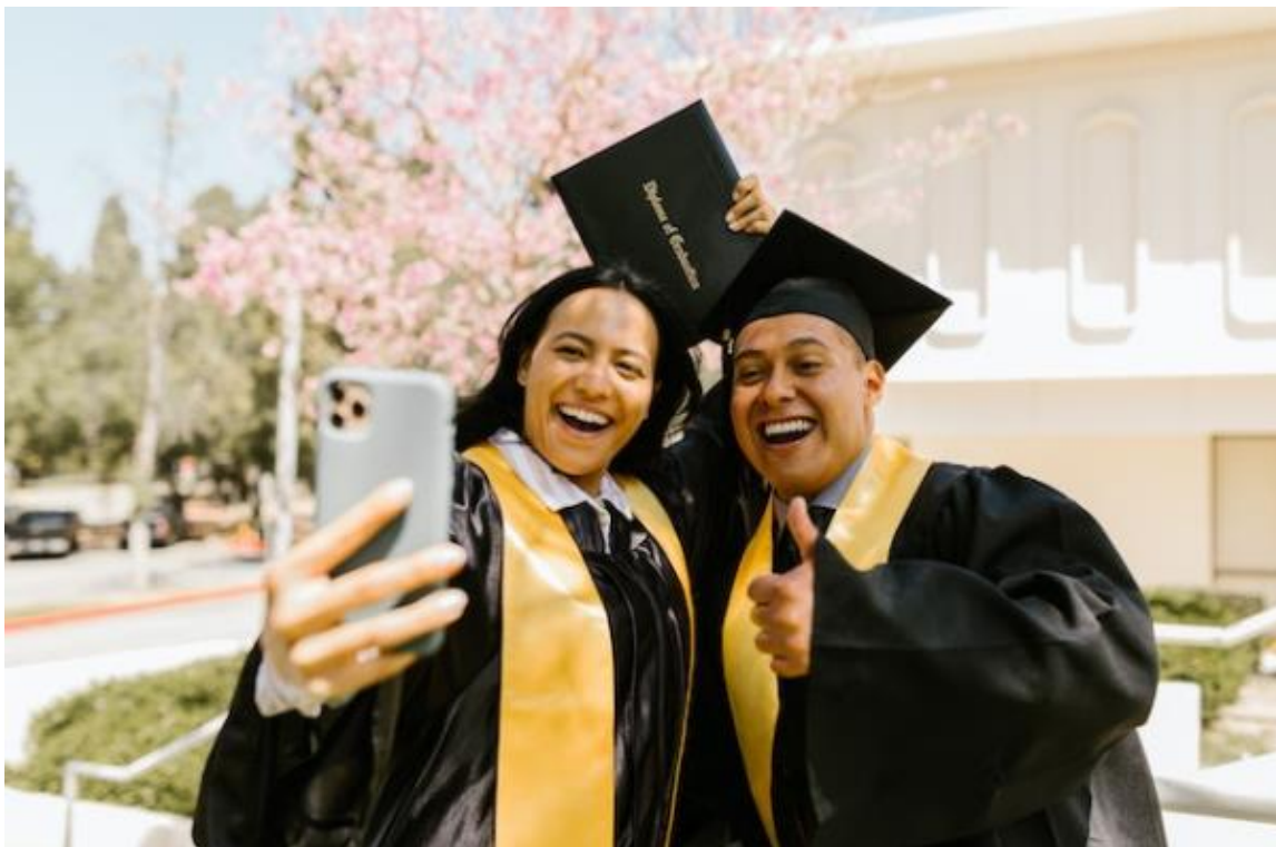
FAFSA/CA Dream Act Workshops