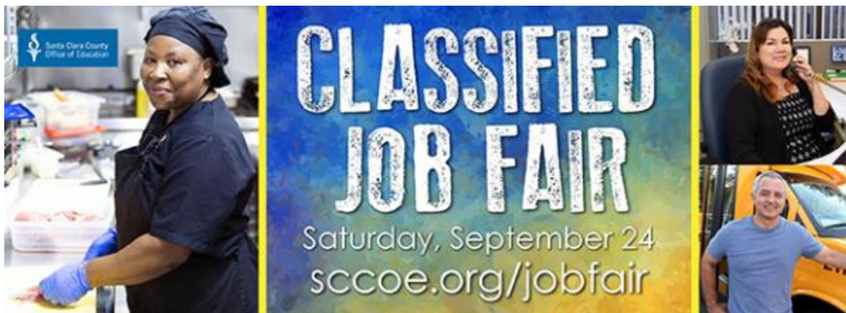
Make an impact in schools

Celebrate Autumn at the 27th annual harvest festival, Pumpkins in the Park! This family-friendly event is a great place to welcome the fall season while exploring the Guadalupe River Park in Downtown San Jose. Stop by anytime between 10 a.m. to 4 p.m. on Saturday, October 8 in Discovery Meadow to enjoy community booths, live entertainment, food trucks, and more!