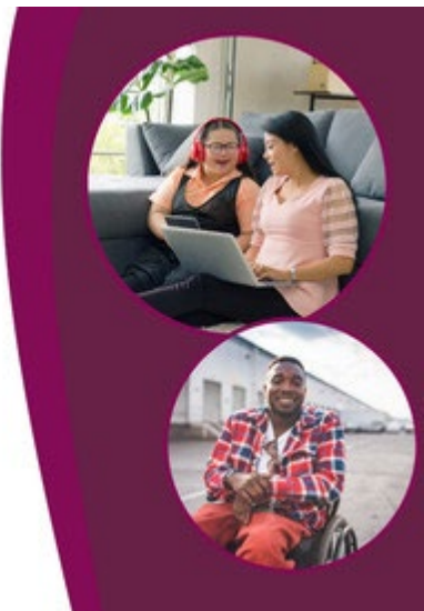
Planning process to launch the Office of Disability Affairs