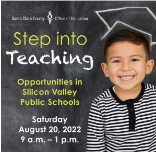
Step Into Teaching

Join us for the SCCOE's Virtual Step into Teaching: Opportunities in Silicon Valley Public Schools Event to help you learn and prepare for the joys of a teaching career.