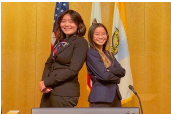
Teen Civics Summit

Join TeenHQ and the San Jose Youth Commission for the first annual Teen Civics Summit on Saturday, August 6 from 11 a.m. to 4 p.m. at King Library.