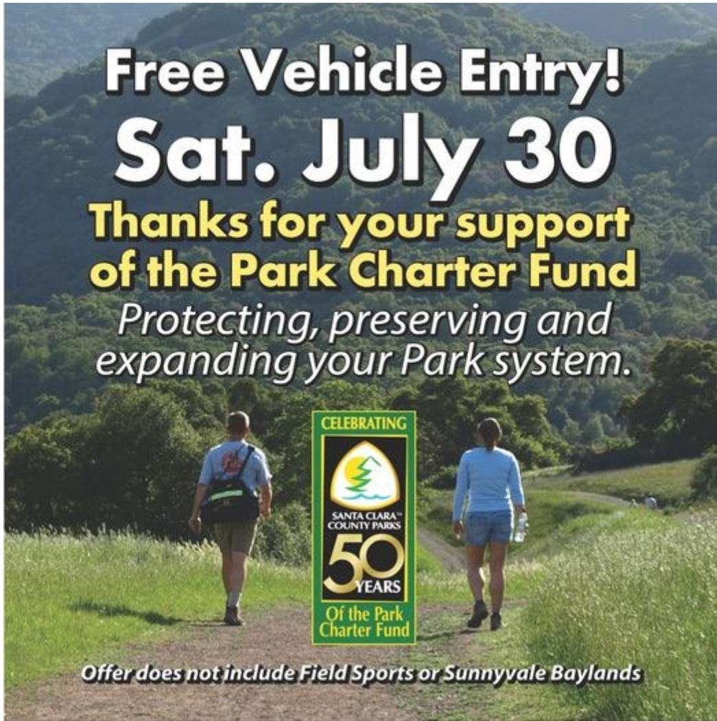
Free vehicle entry to county parks