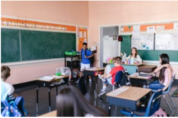
First day of school tips

Are you a new elementary school teacher? This excerpt from "The Art of Teaching Children" can help you prepare for a successful first day of school.