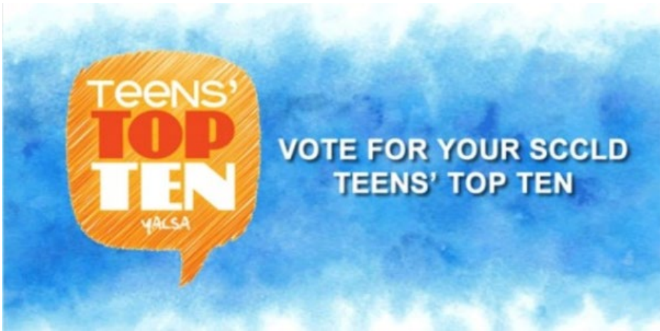
Vote for your top 10

The Santa Clara County Library District 's teen librarians want to hear from you! Every year, the Young Adult Library Services Association (YALSA) creates a teen choice list. Teens can nominate and choose their favorite books from the previous year from a list of nominees. Get your votes in for your favorite book by Sunday, July 31 and you could win a prize drawing! See more information at https://bit.ly/3lAxcJr .