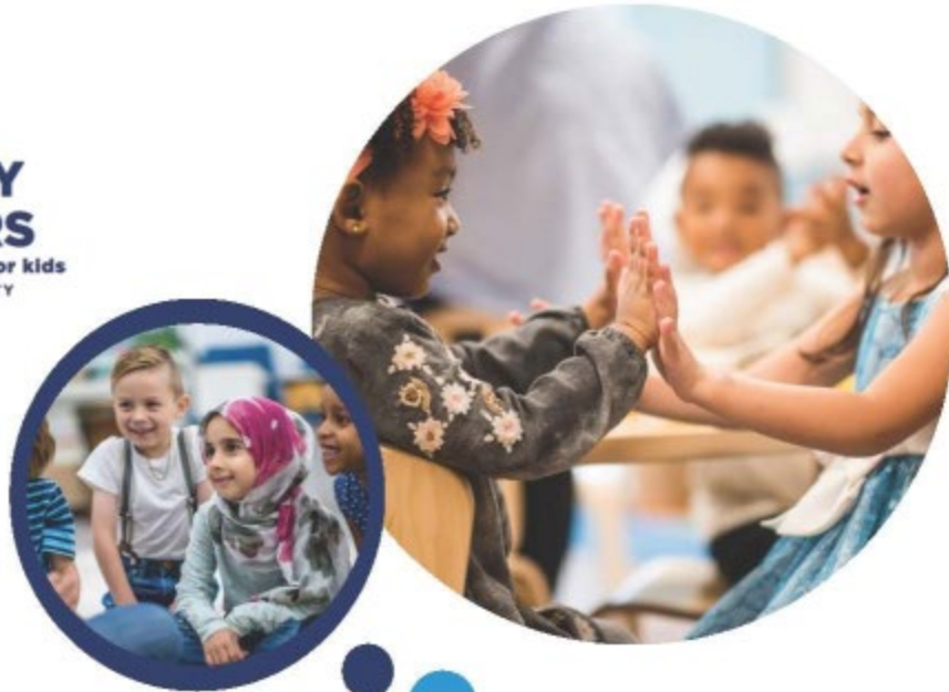
Quality Matters Apprenticeship Program

Quality Matters is Santa Clara County's local quality rating and improvement system committed to giving early educators access to information, resources, and opportunities to provide the best care to children and families in the county. For more information, visit FIRST 5 Santa Clara County .