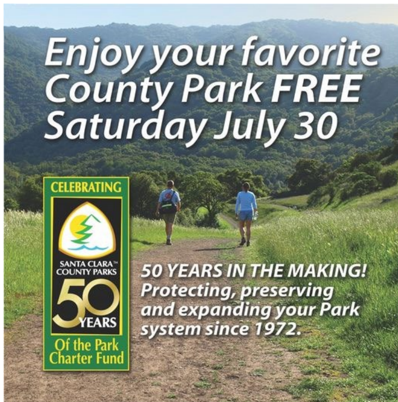
Enjoy SCC Parks for Free on July 30

Call 888-677-1199 Monday-Friday from 9 a.m. to 8 p.m. (Eastern) or email DIAL@usaginganddisability.org .