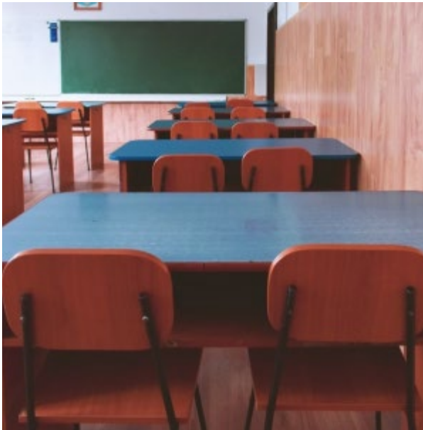
Empty school desks

Quality Matters is Santa Clara County's local quality rating and improvement system committed to giving early educators access to information, resources, and opportunities to provide the best care to children and families in the county. For more information, visit FIRST 5 Santa Clara County .