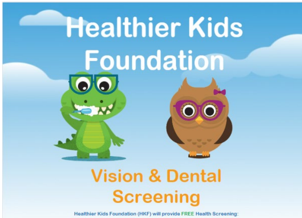
Vision and Dental Screenings

The Healthier Kids Foundation will be offering free eye exam and dental screenings for children 6 months to 18 years old in partnership with the San Jose Public Library System.