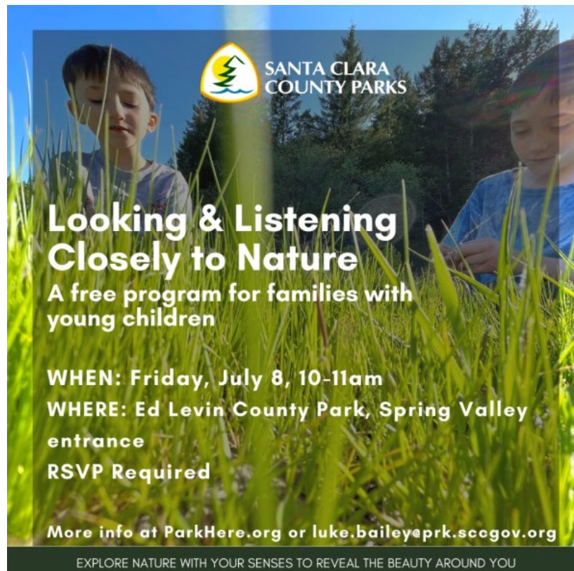
Calling all kids ages 3 to 7 - Click to sign up!

Learn how to #RecycleRight this summer! Register for this virtual class on Friday, July 8. We'll cover what goes where, answer your recycling questions, and go over what to do with tricky summer-related items. You can register at bit.ly/RRClassJuly8