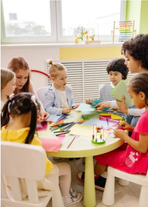
Kindergarten students at a table