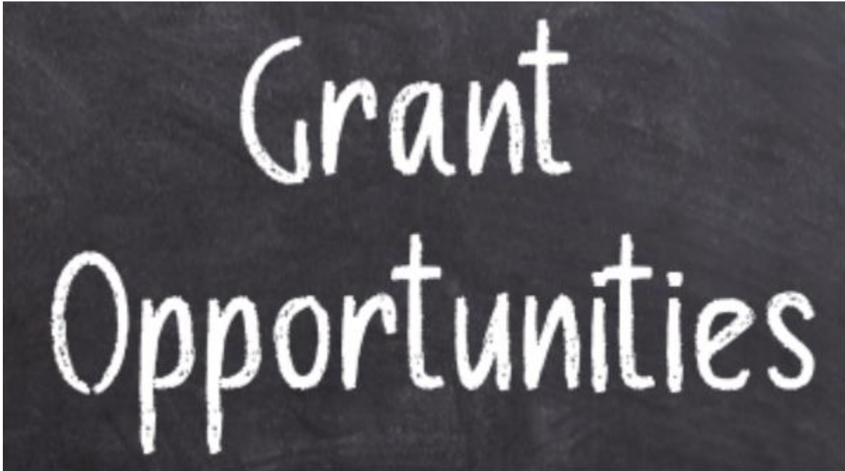
2022 Grant Opportunities

You can register here: https://na.eventscloud.com/ereg/index.php?eventid=687935&