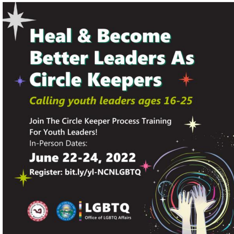
Training for youth

Your video or message may be used in an SCCOE PSA or Social Media Campaign over the course of the next year.