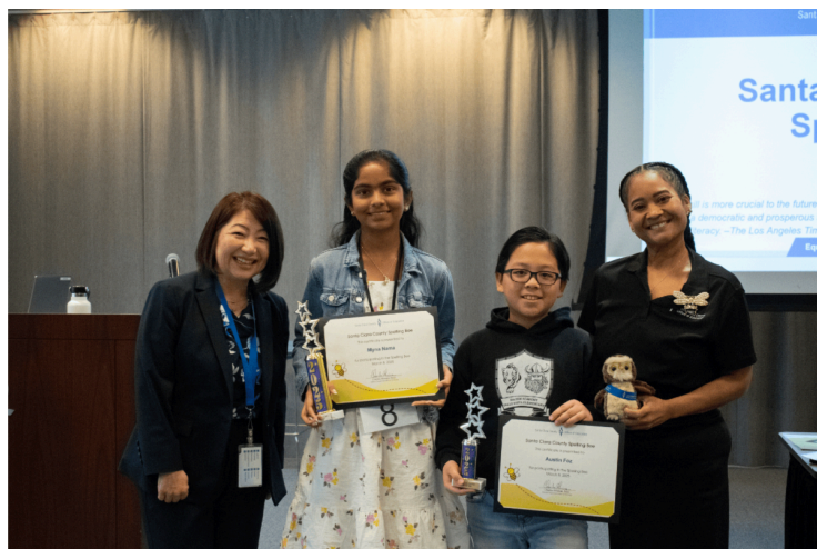
2025 Spelling Bee Participants

School administrators or spelling bee coordinators are invited to join the Santa Clara County Spelling Bee Information Meeting on September 18, 2025 .