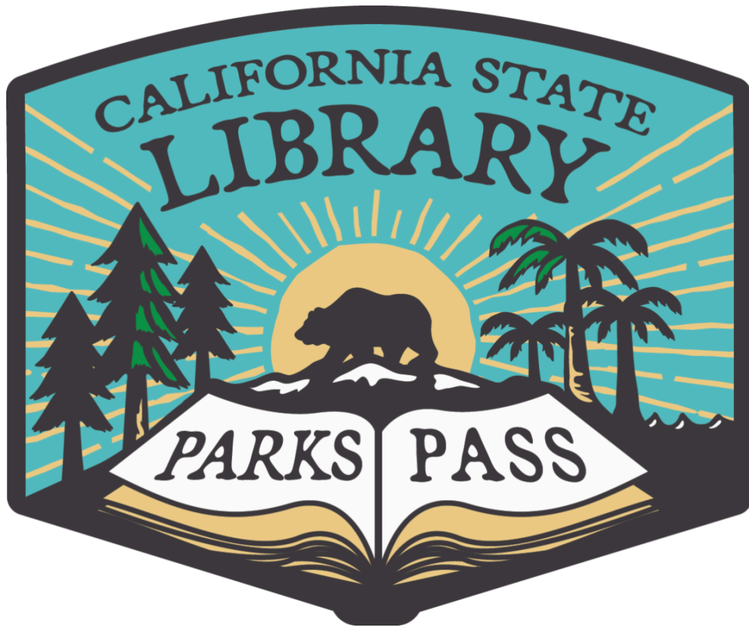
San Jose Public Library Park Passes

Visit California State Parks with a San Jose Public Library card! Check out the free State Parks vehicle day-use passes or the Outdoor Exploration Packs for extra equipment for your adventures.