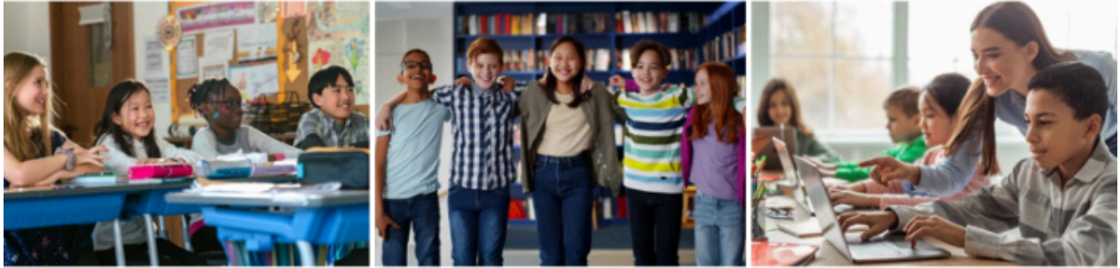
Supporting Multilingual Learners in STEM

The SCCOE's Core Instructional Team (Math/Science/ELA/ELD) will be hosting a 3-day in-person elementary institute for educators in grades 3rd-5th, June 24 to 25, from 9 a.m. to 12 p.m. Multidisciplinary school/district teams are encouraged to attend together including educators, school principals, TOSAs, district leadership, etc.