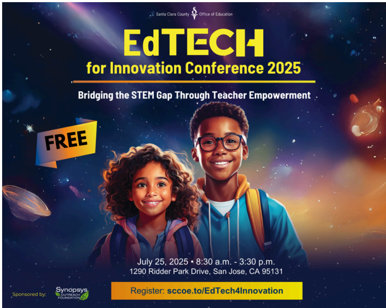
EdTech for Innovation Conference