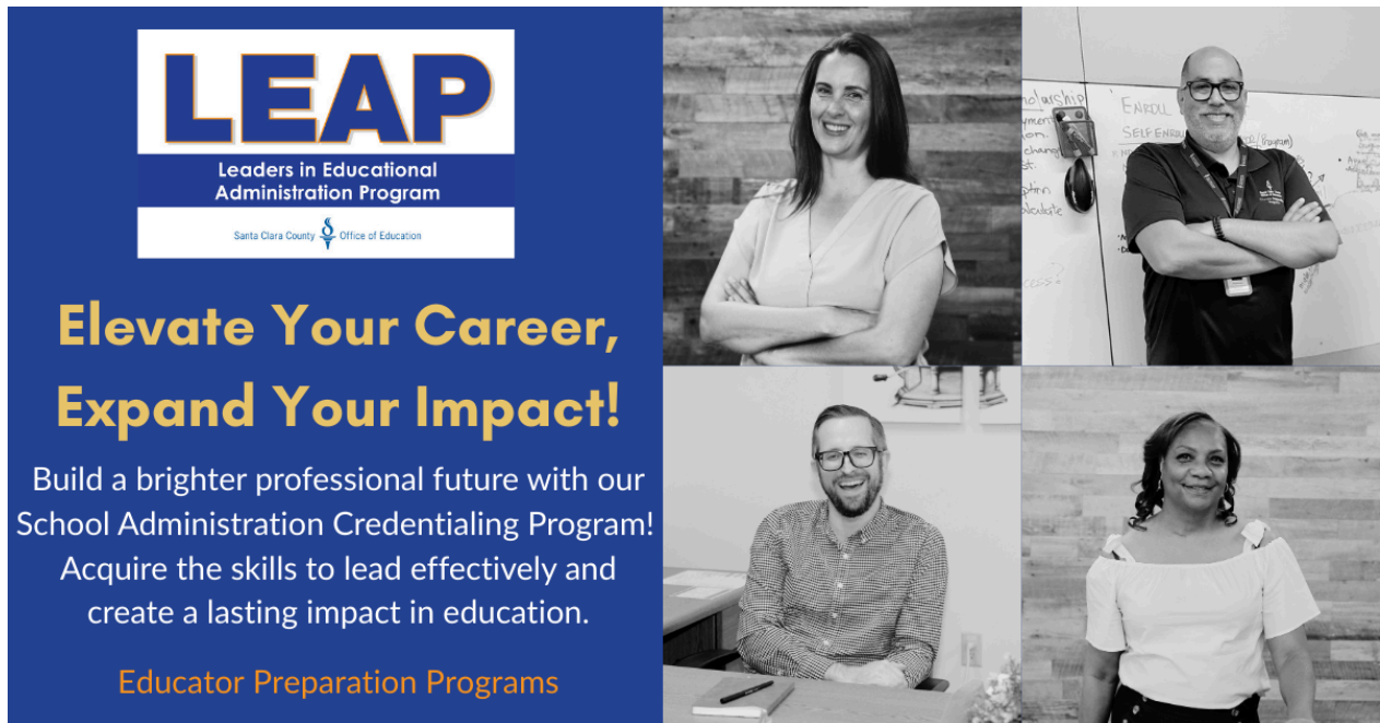
Leaders in Educational Administration Program (LEAP)

Looking to take the next step to becoming a school leader? Begin your journey with the Leaders in Educational Administration Program (LEAP) and join the fall cohort.