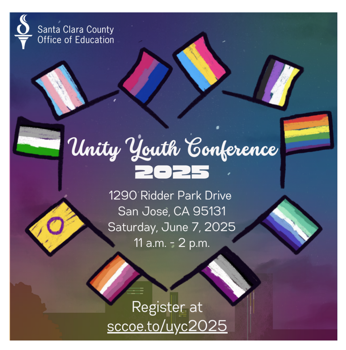
Unity Youth Conference 2025: Rewriting Our Stars

The Unity Youth Conference 2025: Rewriting Our Stars is a youth-led event designed to empower, uplift, and inspire young people to take control of their futures and become change-makers in their communities. Through interactive workshops and peer-led discussions, the conference provides a platform for youth to explore identity, wellness, leadership, and advocacy. This year's theme emphasizes the power young people have to reshape their narratives, break cycles, and define success on their own terms.