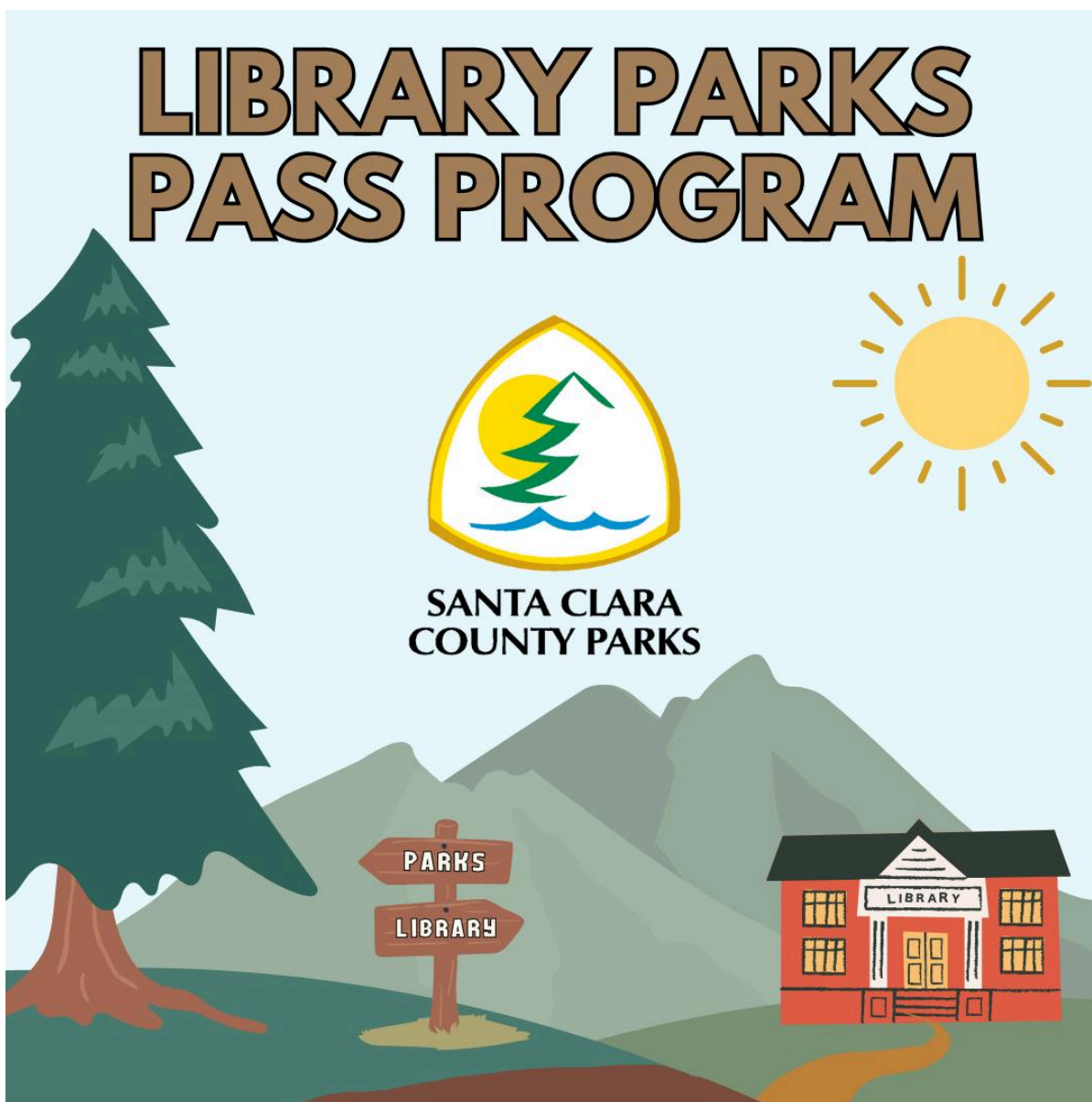
Santa Clara County Parks Library Parks Pass Program

For more information about this event, visit: BayAreaChampion.com