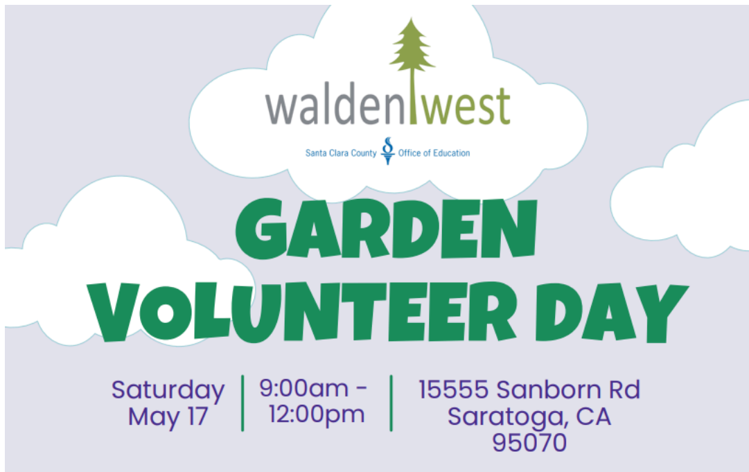
Walden West Garden Workday

To register, please visit https://sccoe.to/2025YASCelebrate