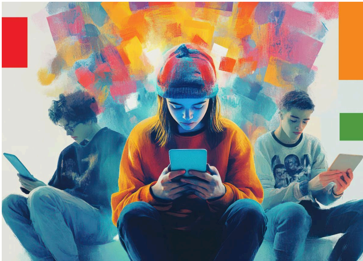
Symposium on Digital Health in Youth

The Healthier Kids Foundation will be hosting the Symposium on Digital Health in Youth. In this discussion, experts will look at why kids are on their devices so much; why some children may be disproportionately affected by overuse; and how kids and their families can establish a healthy relationship with the ubiquitous screens in our everyday lives. Are devices inherently bad or is it the applications or the amount of time?