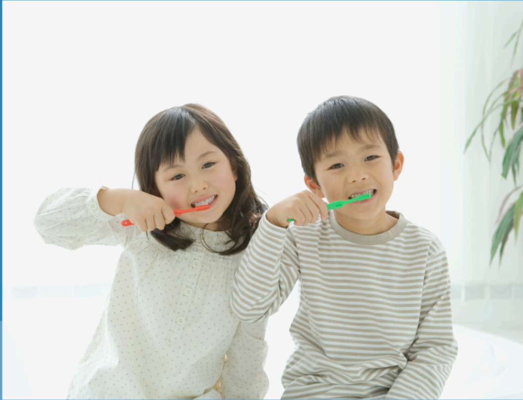
SCCPHD Happy Teeth Event

Join the County of Santa Clara Public Health Department for the 3rd annual Happy Teeth Event, hosted by Santa Clara Valley Healthcare! Free dental screenings and fluoride varnish treatments will be provided for youth ages 0 to 18, all foster youth ages 0 to 26, and all pregnant people.