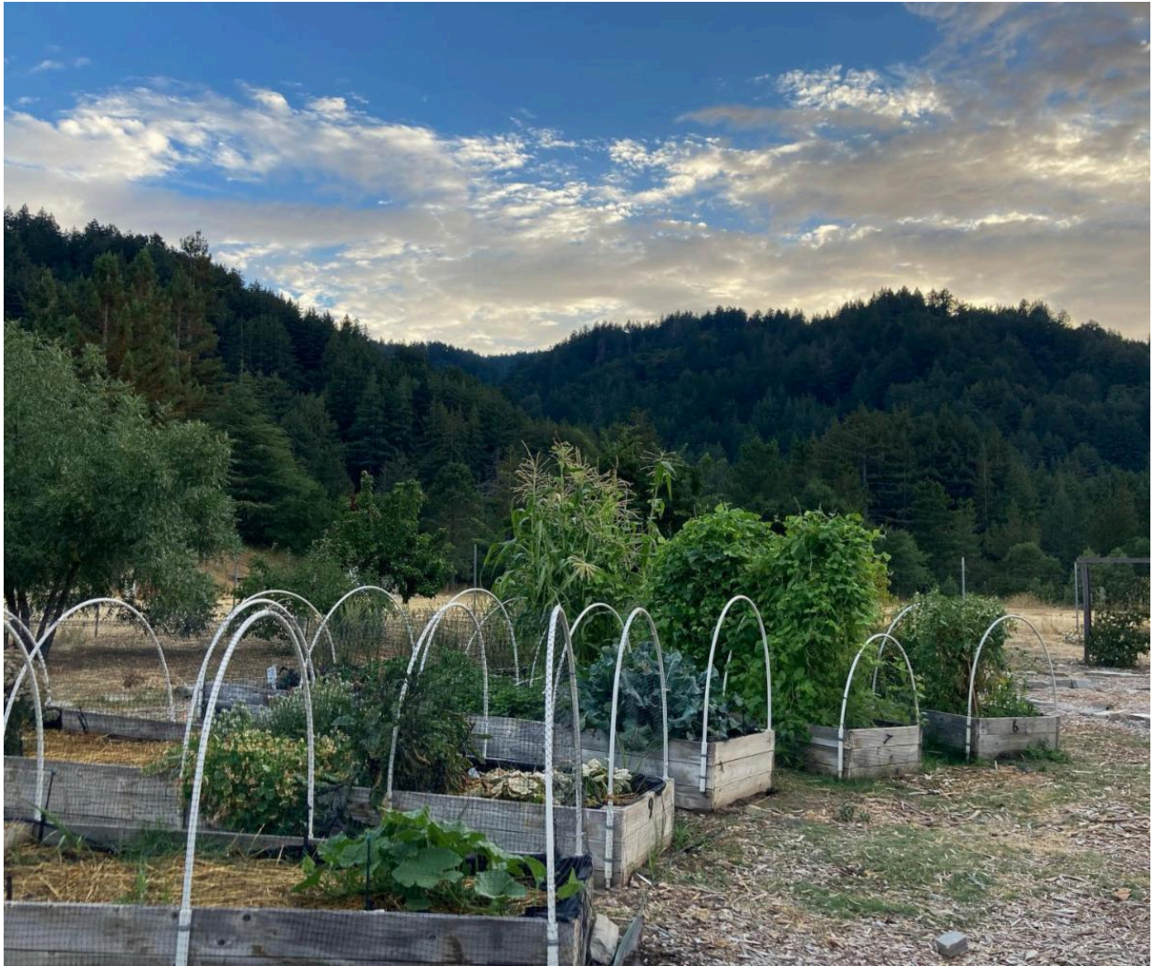
Walden West Garden Volunteer Day 2025

Join us on May 17, 9 a.m. to 12 p.m. for a morning of volunteering in the Walden West Garden! We'll be helping with garden maintenance tasks like weeding, watering, mulching, and planting. We'll also have a couple of special projects to improve the space. Breakfast and tools will be provided by the Walden West Foundation. Please bring a refillable water bottle, long sleeves, pants, and closed-toe shoes. Registration is required.