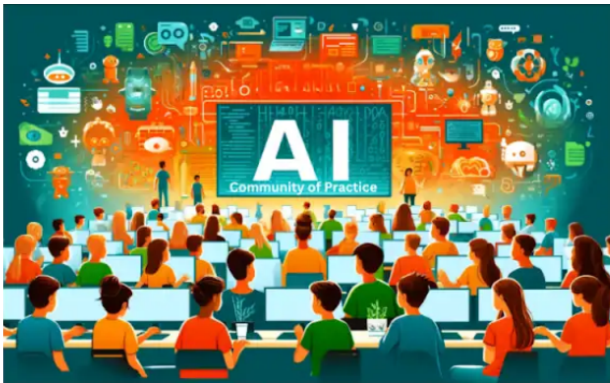
AI Community of Practice for the 2024-25

Don't miss the AI Community of Practice for the 2024-25 school year, with online sessions designed specifically for educators looking to harness the transformative potential of AI in education. Learn to ethically and effectively integrate AI tools to enhance student support, gain access to valuable resources, and engage in continuous learning to stay abreast of rapid technological advancements.