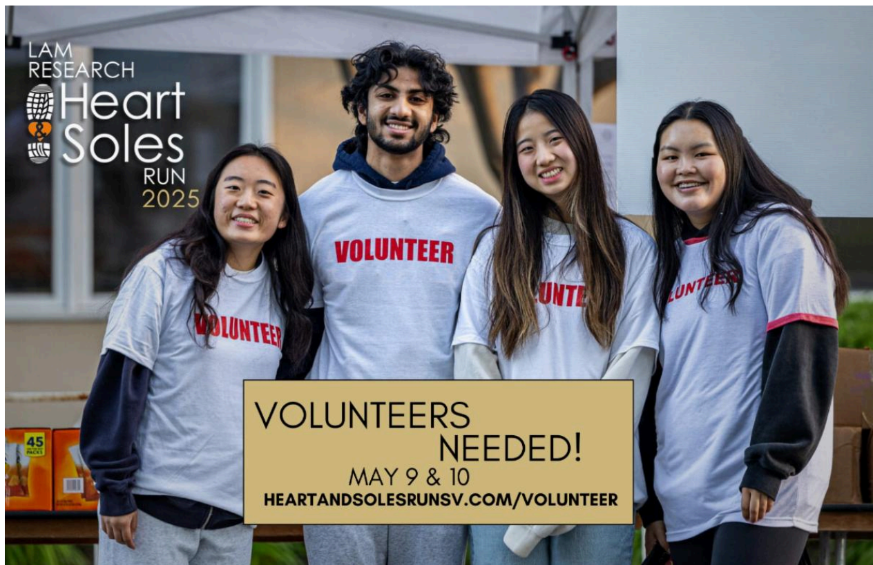
The Heart and Soles Run Volunteers

Are you looking for a fun way to give back to your community? The Heart and Soles Run seeks volunteers on Race Day (May 10) and Packet Pickup (May 9). Help support this event by giving out shirts and bibs, assisting runners along the course, or handing out water, snacks, and medals. It's a great way to be part of this event that benefits local youth health and nutrition programs—even if you don't feel like running!