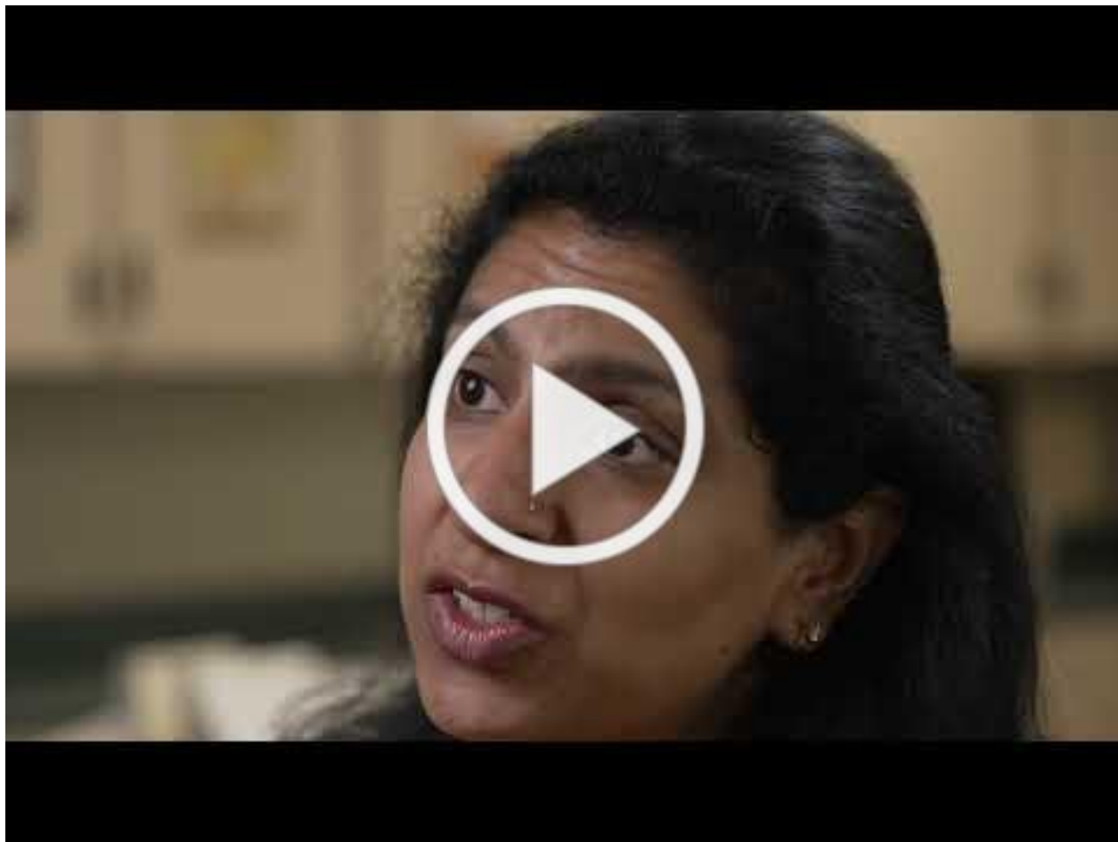
Education Specialist Preliminary Credential Program

Apply for your Education Specialist Preliminary Credential (EPIC) before the deadline! Learn more about SCCOE's EPIC pathways with concentrations in Early Childhood Special Education (ECSE), Mild Moderate Support Needs (MMSN), and Extensive Support Needs (ESN) and start your career in education.