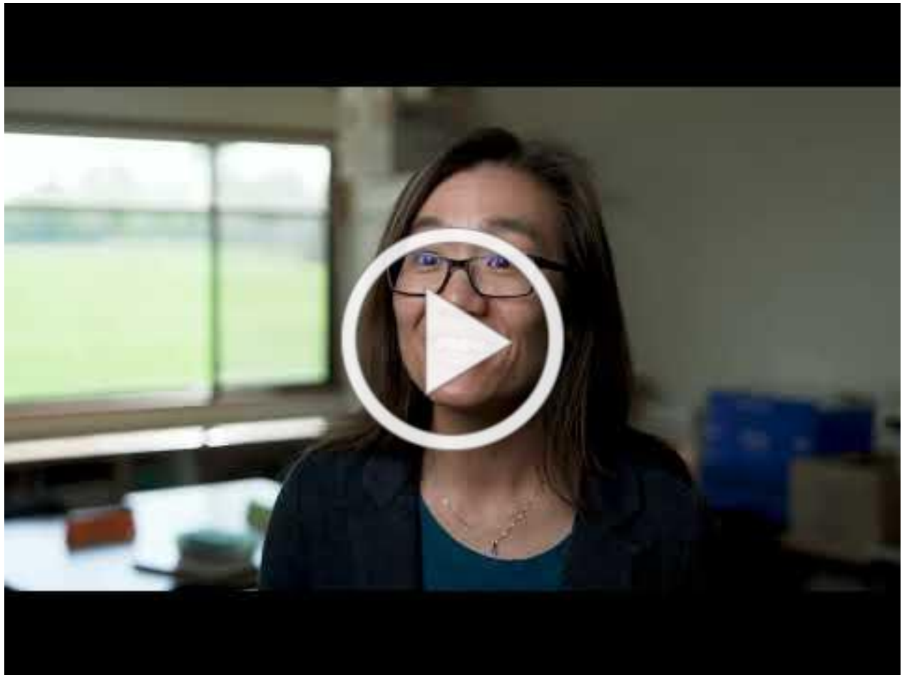
Education Specialist Preliminary Credential Program

Don't wait to start your career in education; watch the video and get inspired! Learn more about the Education Specialist Preliminary Credential (EPIC) pathway with concentrations in Early Childhood Special Education (ECSE), Mild Moderate Support Needs (MMSN), and Extensive Support Needs (ESN).