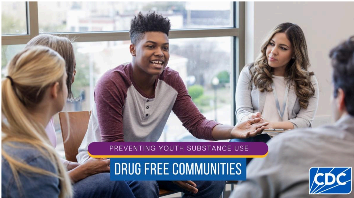
CDC's Drug-Free Communities Support Program