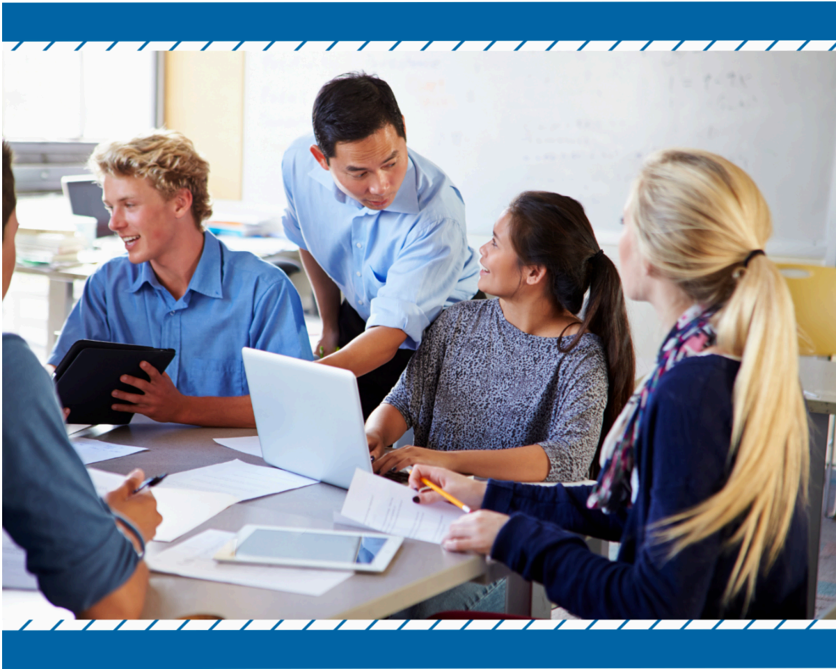
Expository Reading and Writing Curriculum Introductory Training Series

Join us for the Expository Reading and Writing Curriculum Introductory Training Series and learn evidence-based, engaging strategies aligned with the CA Common Core Standards for English Language Arts and English Language Development. Become familiar with the ERWC pedagogy and investigate rhetorical reading, writing, and inquiry processes.