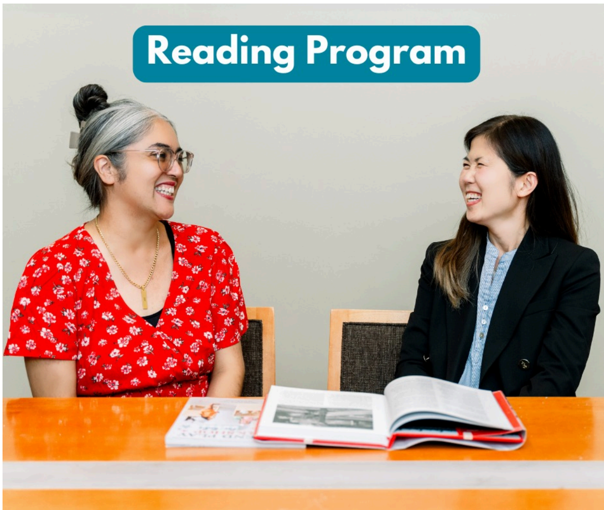
SCCLD Reading Program

Find out how your community can get involved: https://bit.ly/4fByUZM