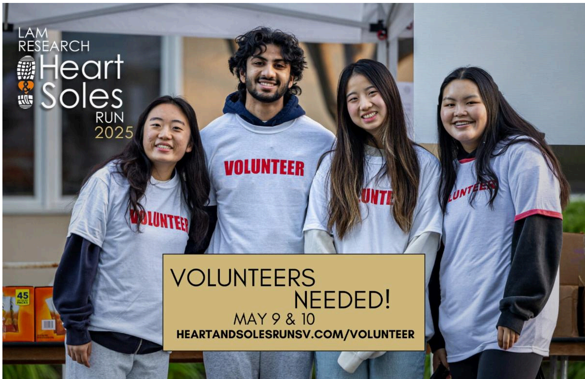
2025 Heart & Soles Run Volunteers

Are you looking for a fun way to give back to your community? The Heart and Soles Run seeks volunteers on Race Day (May 10) and Packet Pickup (May 9). Help support this event by giving out shirts and bibs, assisting runners along the course, or handing out water, snacks, and medals. It's a great way to be part of this event that benefits local youth health and nutrition programs—even if you don't feel like running!