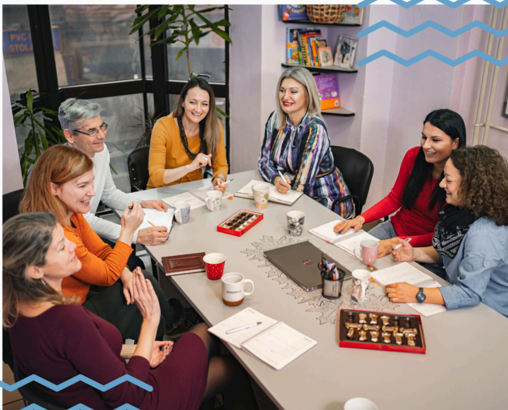
EPP Asset-based Leadership for Learners Webinar

Join the SCCOE for a four-session webinar series focused on Asset-Based Leadership for Learners of All Ages and Backgrounds. This interactive series will provide valuable insights and practical strategies to strengthen your leadership skills in education.