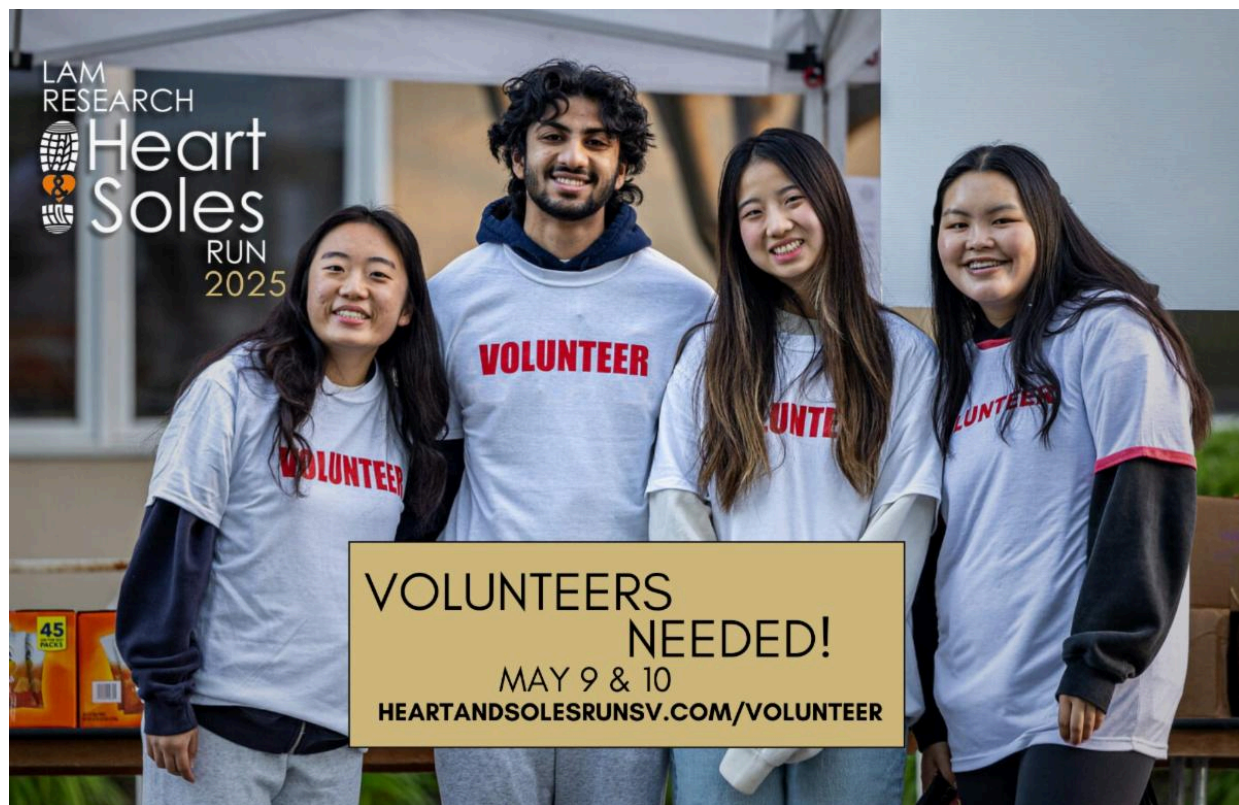
Heart and Soles Run Volunteers

To play online with us please visit: https://sccoe.to/mathweek