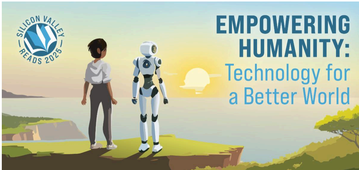
Silicon Valley Reads

Celebrate Read Across America with three opportunities to connect with award-winning authors and explore the magic of storytelling, technology, and nature.