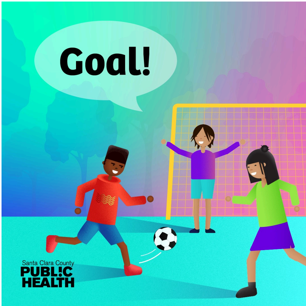
SCCPHD Childhood Vaccines

The Santa Clara County Public Health Department wants to remind caregivers that routine vaccines are another part of growing up.