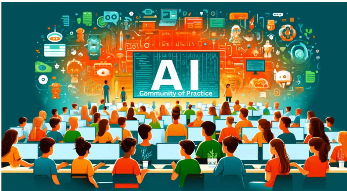
AI Community of Practice for the 2024-25

Join our AI Community of Practice for the 2024-25 school year, with online sessions designed specifically for educators looking to harness the transformative potential of AI in education. Learn to ethically and effectively integrate AI tools to enhance student support, gain access to valuable resources, and engage in continuous learning to stay abreast of rapid technological advancements.