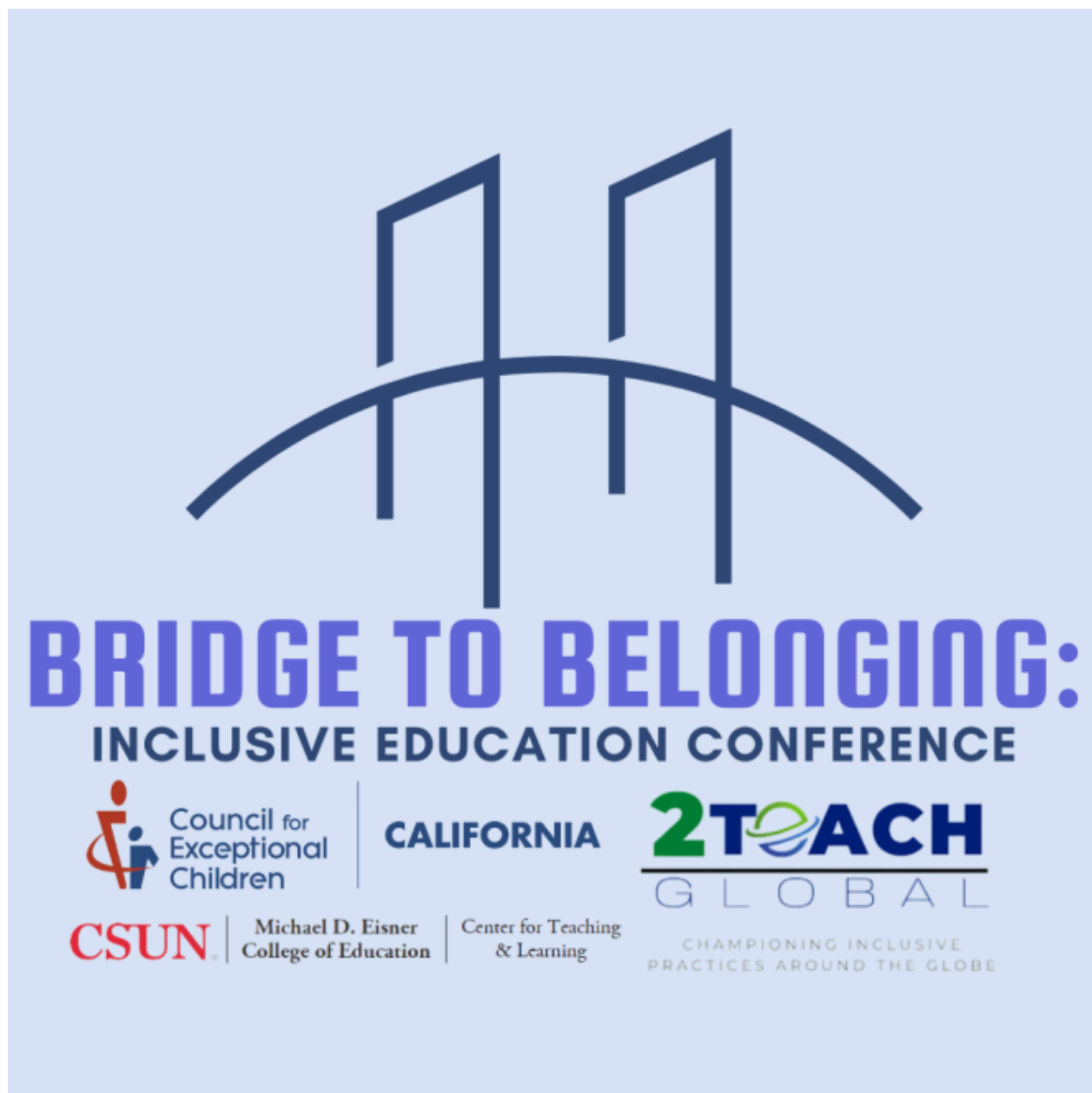
Bridge to Belonging: Inclusive Education Conference

The California Council for Exceptional Children (CA CEC) is thrilled to offer the Bridge to Belonging: Inclusive Education conference. This two-day conference is dedicated to equipping California educators and administrators with the tools and strategies to make inclusive education successful.