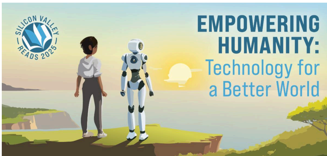
Silicon Valley Reads

To apply visit, https://mhanational.org/youth-policy-accelerator/application