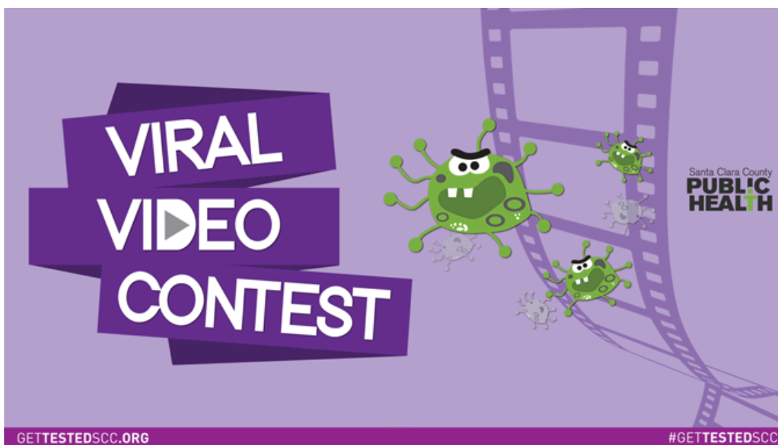
2025 Viral Video Contest

The deadline for high school students to participate in the County of Santa Clara Public Health Department's 2025 Viral Video Contest is around the corner.