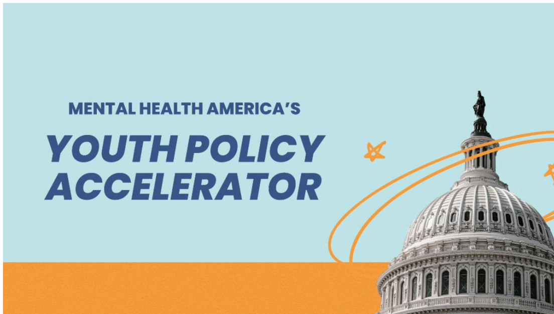
Mental Health America's Youth Policy Accelerator

The Mental Health America's (MHA) Youth Policy Accelerator (YPA) is a youth leadership program that equips 10 outstanding young adults with the skills, relationships, and experience to advance federal youth peer support policy.