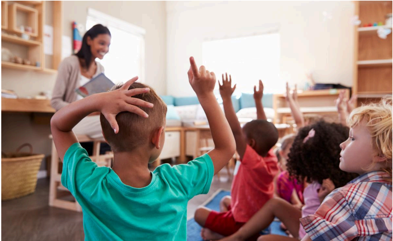
Reading Difficulties Risk Screener: Selection Process, Preparation, and Implementation

The SCCOE is hosting the Reading Difficulties Risk Screener: Selection Process, Preparation, and Implementation series. This 3-part webinar supports Local Education Agencies (LEAs) understand the requirements and recommendations of the new legislation and more.