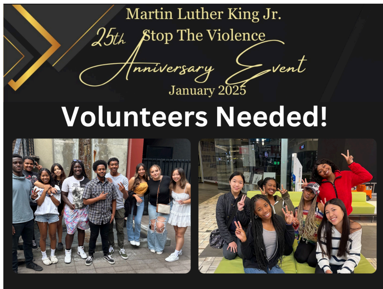
Positive Alternative Recreation Team Building Impact (PARTI)

Join the Positive Alternative Recreation Team Building Impact (PARTI) group and volunteer for the Martin Luther King Jr. 25th Anniversary Event! This two-day celebration honors Dr. King's legacy and promotes peace, cultural appreciation, and community togetherness.