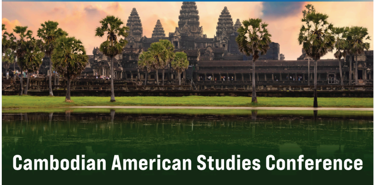
Cambodian American Studies Conference

Join us for the Cambodian American Studies Conference, and learn about the histories, cultures and traditions of Cambodian Americans as part of Education Finance Bill AB 167. Learn about the Cambodian American Studies Model Curriculum project and connect with other educators and community members.