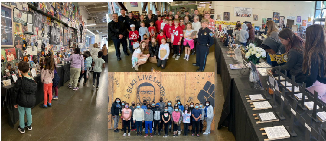
Domini Hoskins Black History Museum and Learning Center Open House

Join fellow educators in getting to know the Domini Hoskins Black History Museum and Learning Center and explore ways to incorporate Black History and Culture into your school classroom.