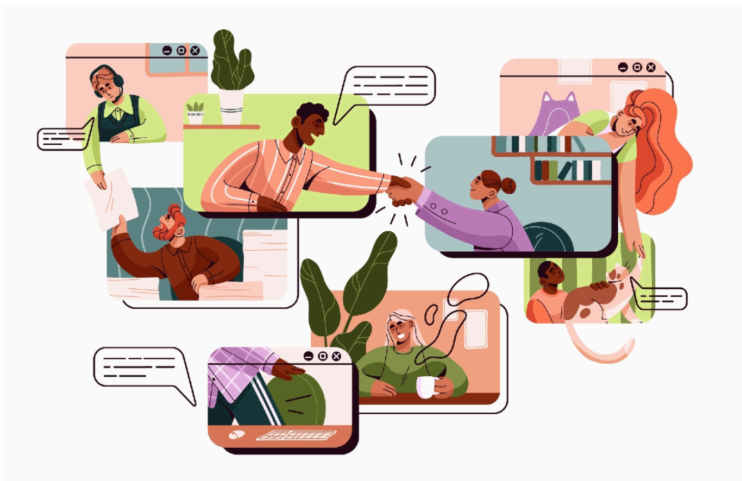
Teachers on Special Assignment (TOSAs)

The SCCOE invites all Instructional Coaches, Mentors, and Teachers on Special Assignment (TOSAs) to the 2024-2025 TOSA & Instructional Coaches Network Meeting. Develop leadership skills, learn more about supporting teachers with content, and network with other instructional leaders.