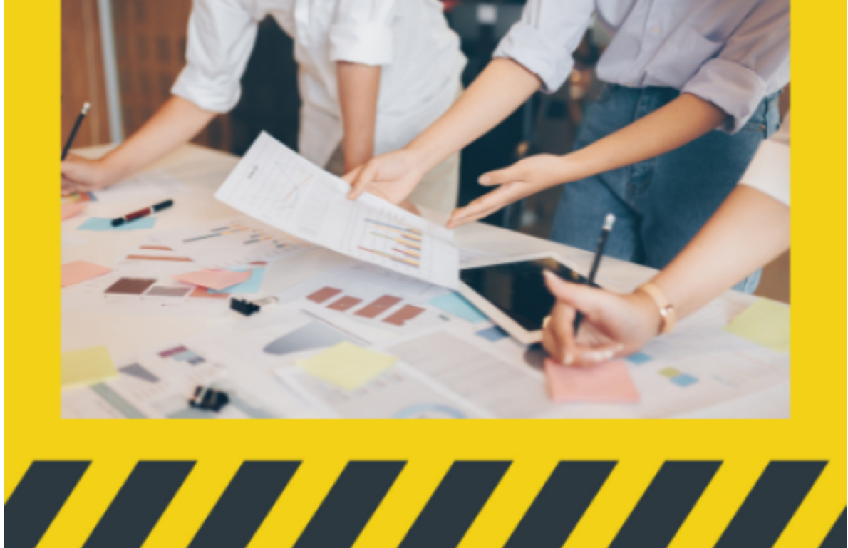
2024 School Safety Plan Webinar

The 2024 School Safety Plan Webinar provides an overview of the current California mandates for school safety planning and provides strategies by sharing tools to integrate safety planning into all school improvement efforts. District and site administrators along with school safety planning and implementation staff are encouraged to attend. The webinar is on November 7 from 9:00 a.m. to 12:00 p.m.