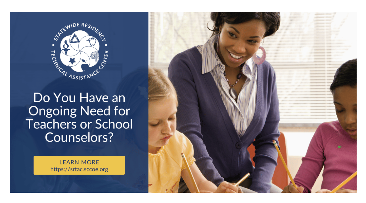
The Statewide Residency Technical Assistance Center (SRTAC)

The Statewide Residency Technical Assistance Center (SRTAC) is led by Santa Clara County Office of Education. We are proud to serve Bay Area districts to initiate, expand, and sustain teacher and counselor residency programs that staff your hardest-to-fill positions and support future educator recruitment and retention. SRTAC assists you to secure grant funding through the Commission on Teacher Credentialing (CTC), and both <a href="Teacher Residency">Teacher Residency</a> and <a href="School Counselor Grants">School Counselor Grants</a> are currently available for application.