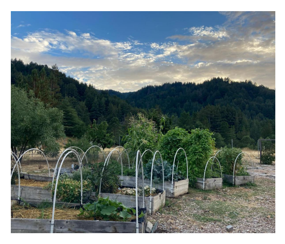
Walden West Volunteers

Join us for a day in the gardens. Volunteer for the Walden West Garden Workday and work with Yarrow, the garden specialist. Tools and work gloves provided but feel free to bring your own!