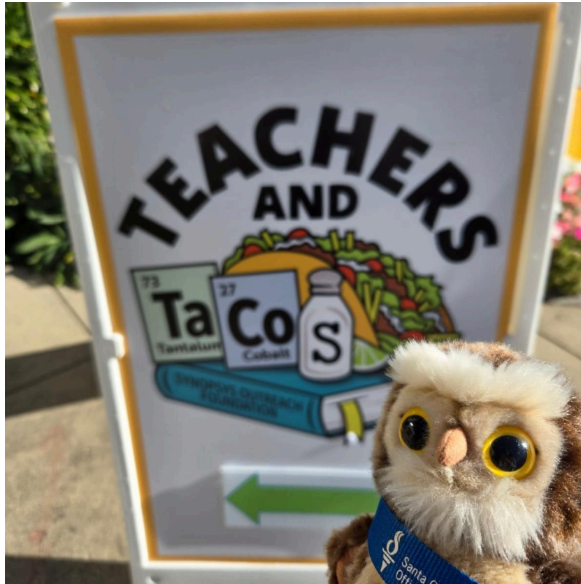
Teachers and Tacos

Join teachers across the county for tacos, free resources, and entry into The Tech Interactive on November 15 from 4 - 6 p.m. To register, visit bit.ly/teachersandtacos