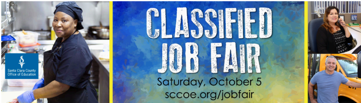
Classified Job Fair

Help the Walden West garden grow during golden hour. Volunteer from 5:30 - 6:30 p.m. on October 8, 15, 22, and 29 to help with regular maintenance tasks such as weeding and watering. Learn gardening and horticultural skills, and take home seasonal garden gifts. Register to volunteer at https://www.ultracamp.com/info/sessiondetail.aspx?idCamp=968&campCode=1mS&idSession=476433