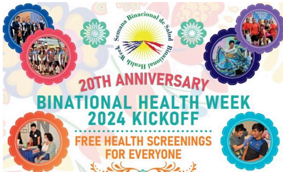
Binational Health Week

Need a place to stay cool during the heatwave? Cooling Centers are available throughout Santa Clara County. To find a Cooling Center near you, visit https://oem.santaclaracounty.gov/disaster-preparedness/hot-weather-safety