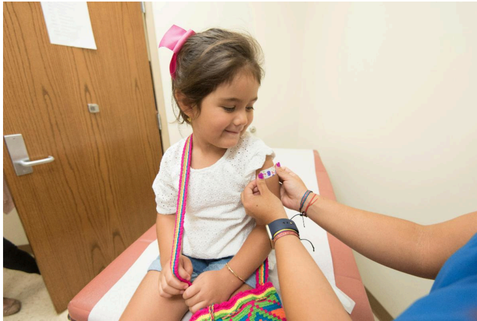
School Nurse CoP

To learn more and register, visit https://www.sccoe.org/tupe/Pages/Events.aspx