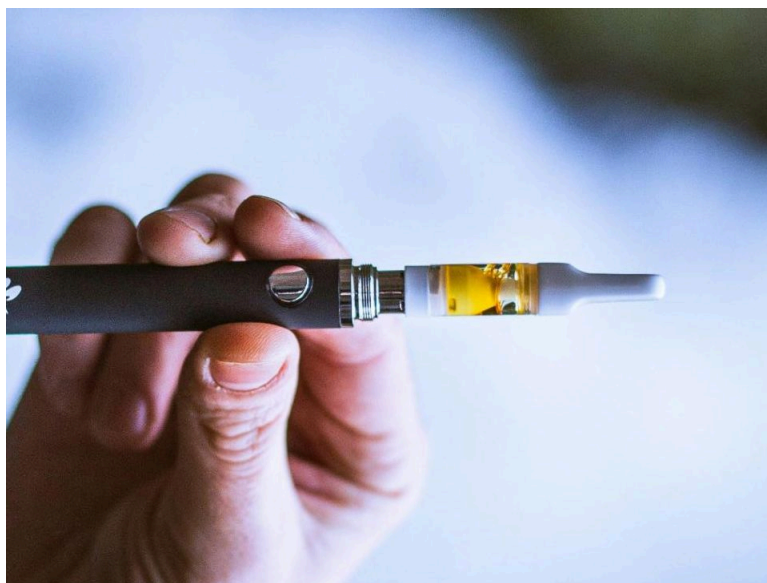
TUPE Parent Education Night