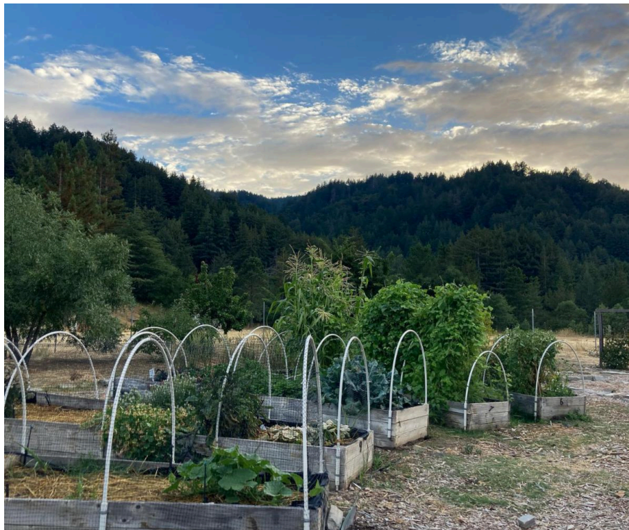
Walden West Volunteers

Every fall, the Teacher Recognition Celebration honors the county's finest teachers, each selected by their respective school districts. For more information about the event, visit www.sccoe.org/trc