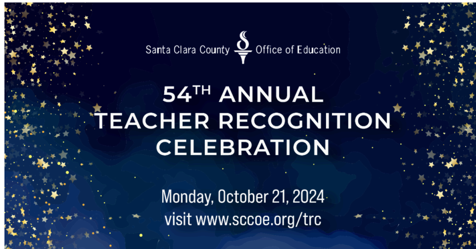
Teacher Recognition Celebration

Every fall, the Teacher Recognition Celebration honors the county's finest teachers, each selected by their respective school districts. For more information about the event, visit www.sccoe.org/trc