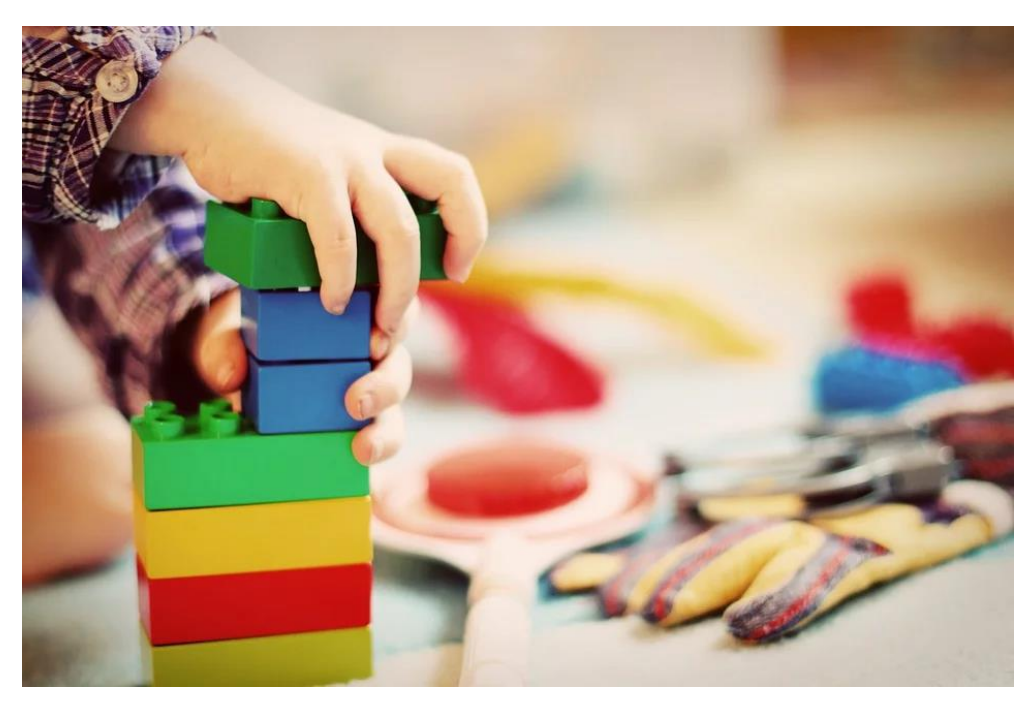
Even though school is closed, you can still learn and have fun. You can go outside, read a book, get creative, and play with your toys.