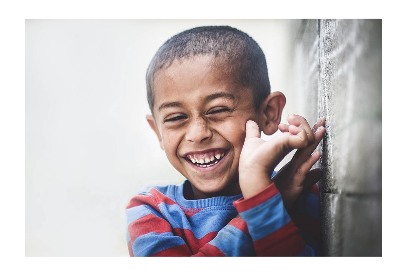
You can stay safe and healthy!