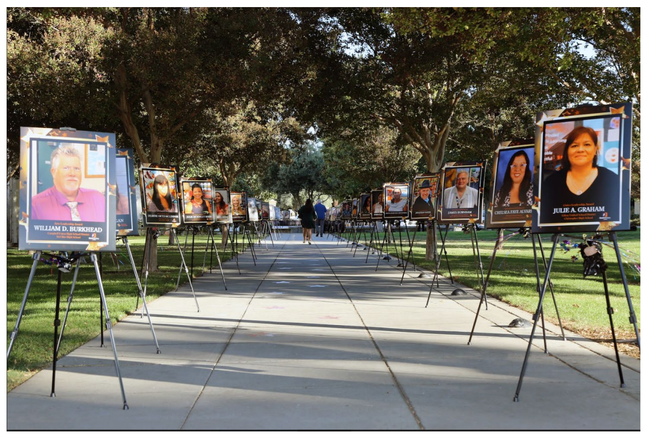
Teacher Walk of Fame