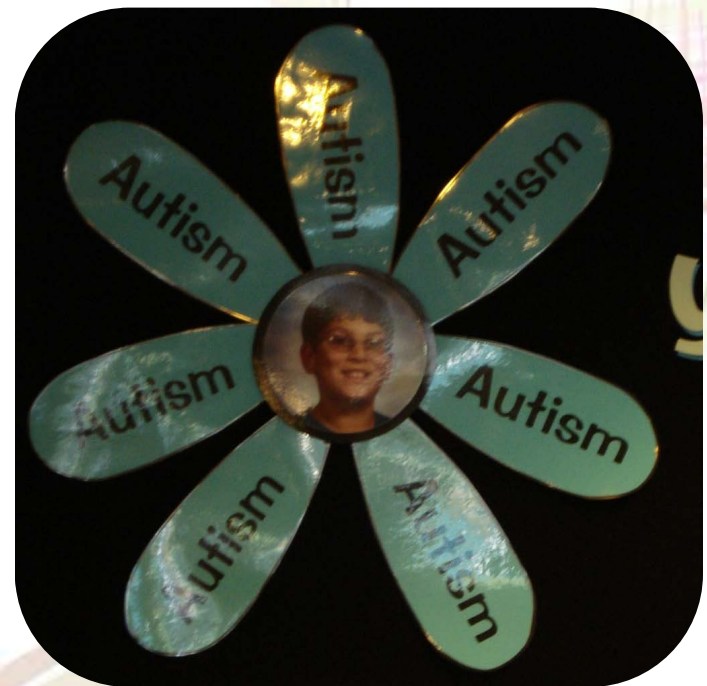
an autistic child