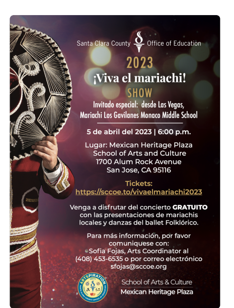
2023 ¡Viva el mariachi! Showcase