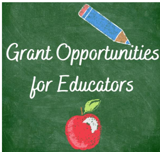
Grant Opportunities for Educators

Educators are encouraged to view the grant opportunities available to them.