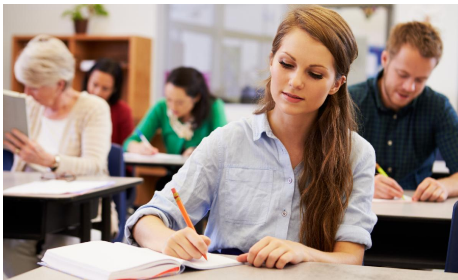
SCCOE's Educator Workforce Pathways

To view them, visit: https://sccoe.to/GrantOpportunitiesforEducators