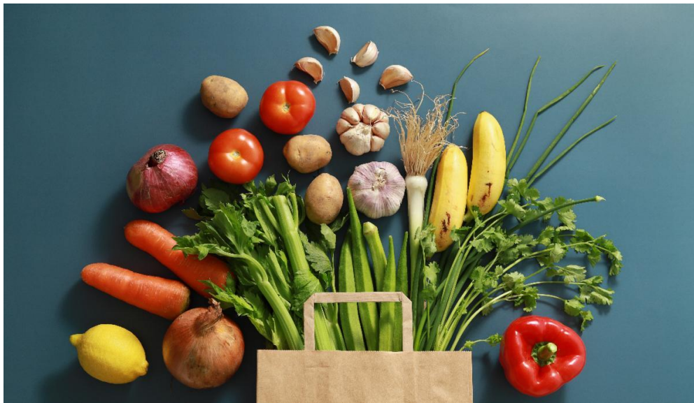
Second Harvest of Silicon Valley

To view this resource, visit: https://news.caloes.ca.gov/what-to-do-after-a-severe-storm/