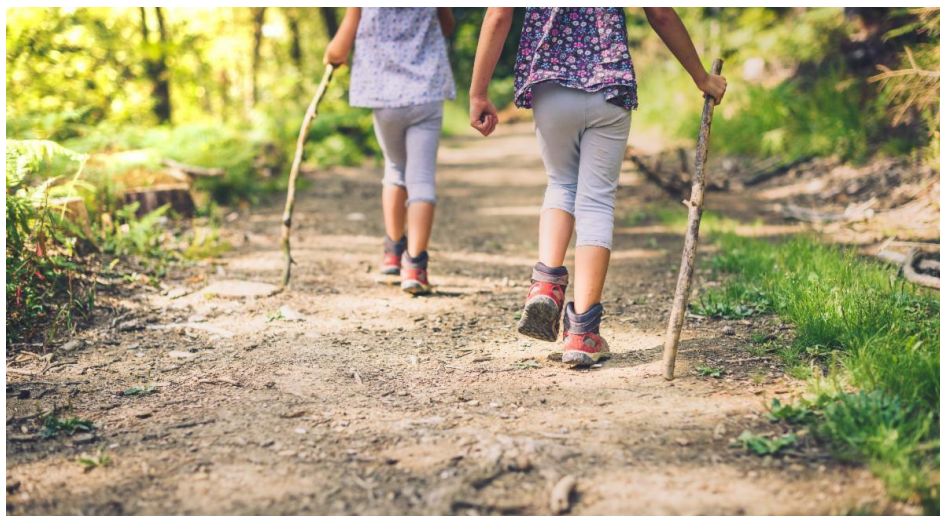
California State Parks Adventure Pass

Fourth grade students can sign up for the free California State Parks Adventure Pass! The Adventure Pass is good for free day-use entrance to 54 select California State Parks for students and their families and is valid until August 31, 2024.