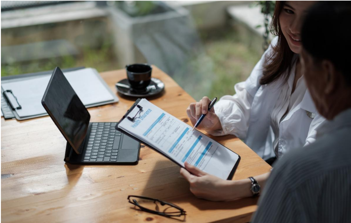
School-Based Billing Training

*There is a cost associated with this training.