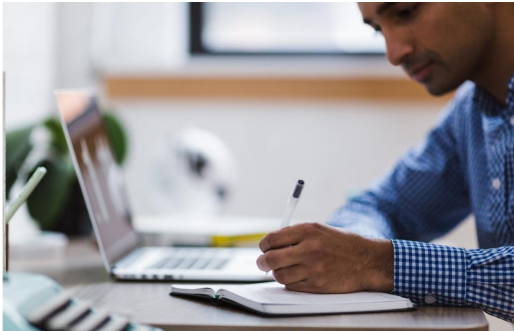
Foundations of Equitable Grading

The SCCOE is offering an online, self-paced course for Foundations of Equitable Grading. In this training, attendees will reflect on current grading practices and how they support students,