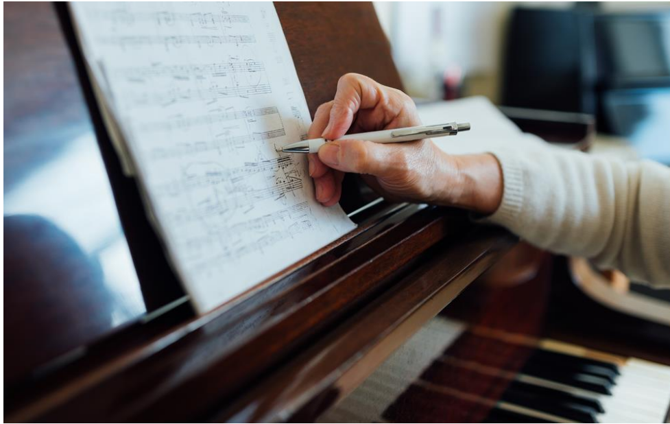
Free Musical Performances

The Santa Clara County Library District will host free musical performances of Beethoven to Broadway. This series will be at multiple locations across the county.