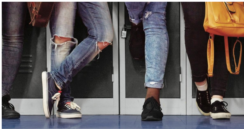
Equity, Pedagogy, and School Transformation

The Santa Clara County Office of Education, in partnership with the authors of Street Data, invite you to a free workshop to radically reimagine our ways of being, learning, and doing. Educators supporting community schools are encouraged to join on May 21 at the Santa Clara County Office of Education's Ridder Park location at 1290 Ridder Park Drive in San Jose.