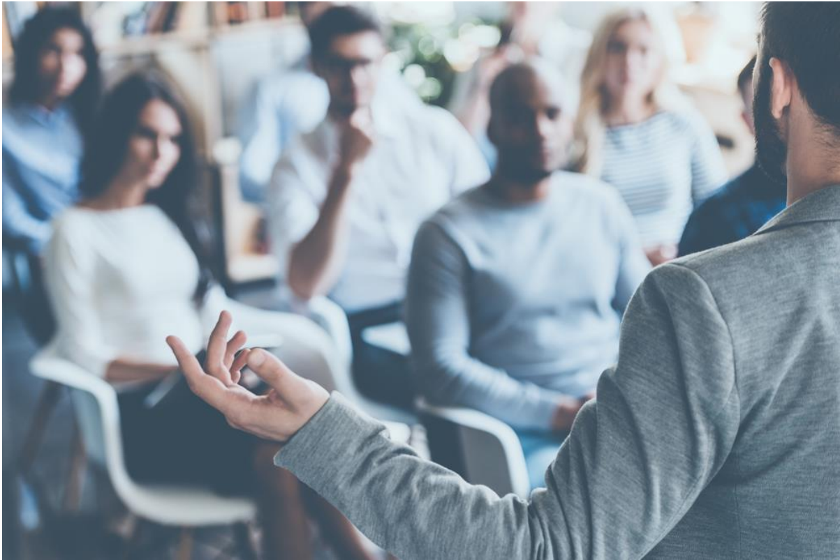
SCCOE Mental Health First Aid Trainings

The Santa Clara County Office of Education is hosting two Mental Health First Aid Trainings. This training will provide attendees with the skills to assist someone experiencing a mental health or substance use-related crisis. These trainings will be April 29-30 and May 22-23.