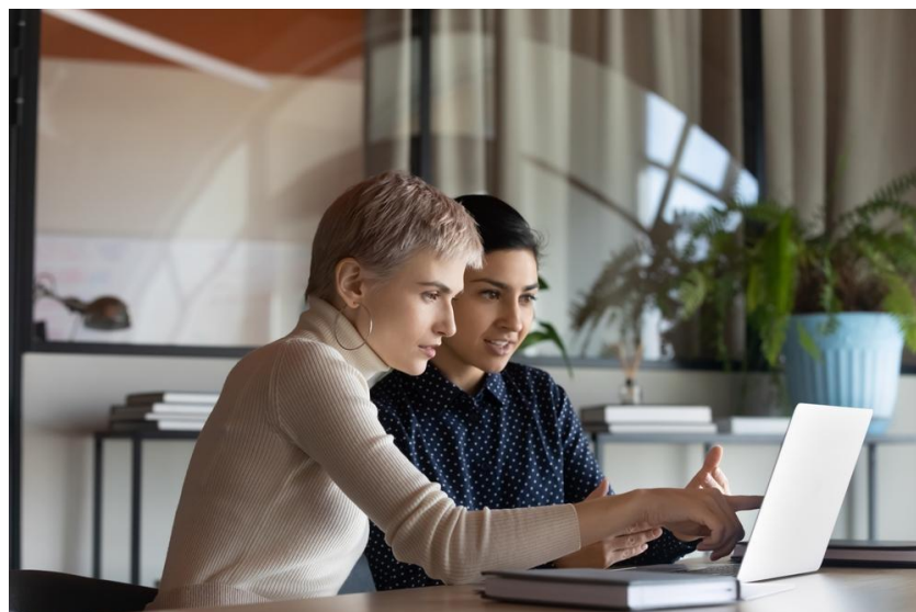
Educator Workforce Pathways (EWP)

To learn more or register, visit: https://na.eventscloud.com/ereg/index.php?eventid=791704&