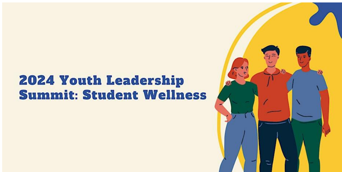
2024 Youth Leadership Summit: Student Wellness

To learn more or register, visit: https://scooe.to/WaldenWestGardenWorkDay