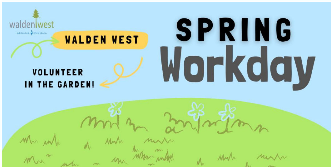
Walden West Spring Garden Workday

Walden West is seeking volunteers to join the Spring Garden Workday. Volunteers of all abilities, ages 14 and older, are invited to participate on May 4, from 9 a.m. to 12 p.m. at Walden West located at 15555 Sanborn Rd in Saratoga.