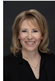
Mary Ann Dewan, Ph.D. County Superintendent of Schools

Young people are the stewards of the future. Together, we can prepare youth for their roles as citizens and participants in our democracy. Today's young people will shape the future of our country and planet. In California, young people ages 16 and 17 are eligible to pre-register to vote, meaning they will be automatically registered to vote when they are 18. By encouraging young people in your life to pre-register to vote, they will feel empowered to advocate for their future. To learn more about how to pre-register to vote, visit: https://www.sos.ca.gov/elections/pre-register-16-vote-18