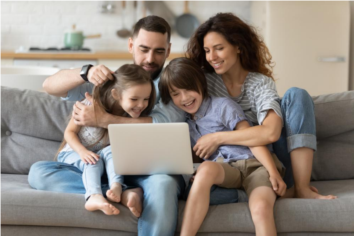
Santa Clara County Early Learning Webinar

Join parents from across Santa Clara County to learn about early learning options (childcare, preschool, and transitional kindergarten). Families will receive an overview of all early learning options, learn how to use the Santa Clara County Childcare Portal to find local licensed providers, get information about expanded eligibility for enrollment in transitional kindergarten, and understand different options to receive help with paying for care, if eligible. To view the Santa Clara County Childcare Portal, visit: https://www.childcarescc.org/