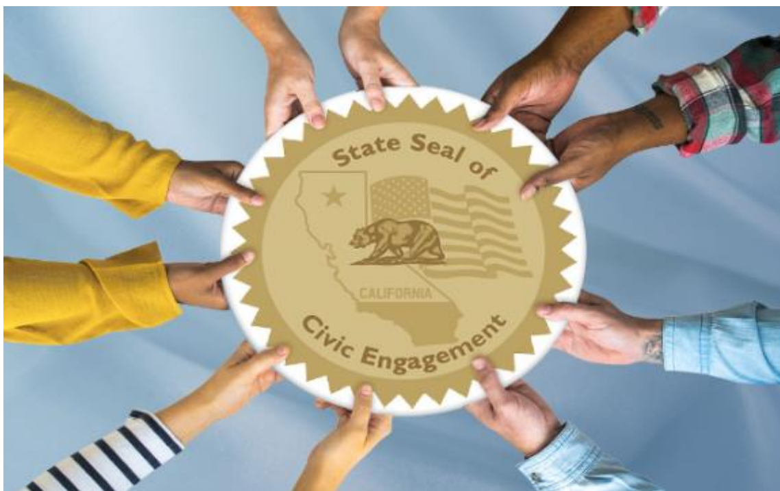
State Seal of Civic Engagement Information Session

Are you an educator looking to learn more about the State Seal of Civic Engagement? The SCCOE is hosting information sessions on the criteria and potential pathways to obtain this seal. The next information session is May 1 from 4 p.m. to 5:30 p.m.