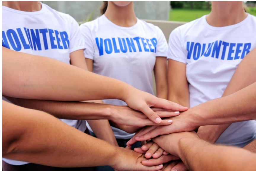
Touch-A-Truck Volunteer Opportunity

To learn more visit: https://tzuchi.us/events/listos-family-safety-expo