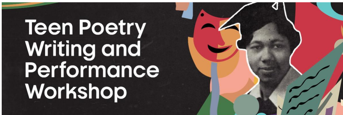
Teen Poetry Writing and Performance Workshop

To learn more or register, visit: https://airtable.com/app6QMkZ1XVQou2ta/paggWHDNbk9afVGnp/form