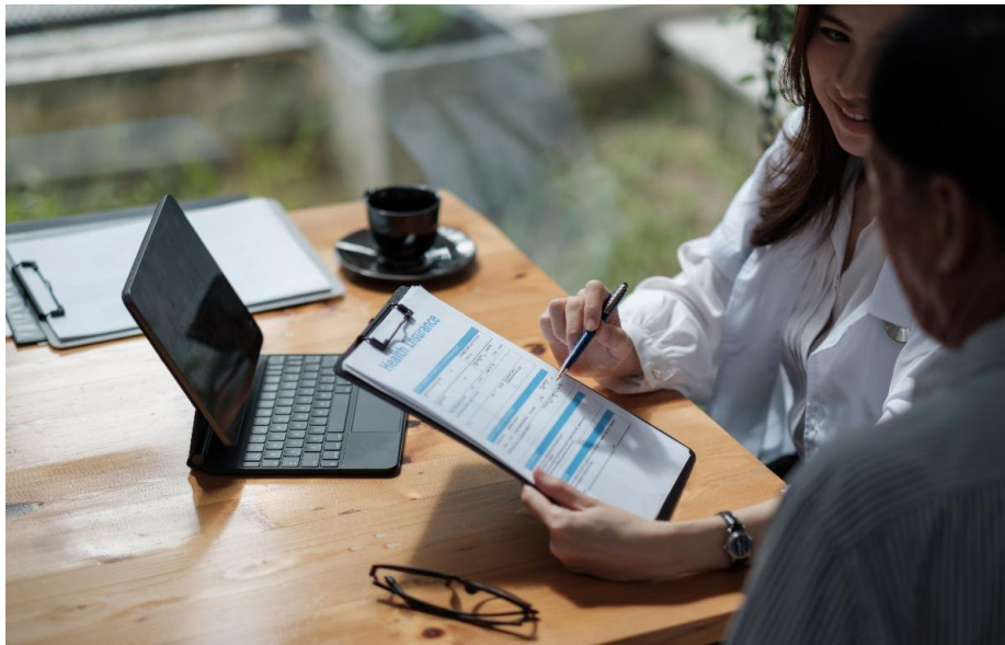
Statewide School-based Billing Professional Learning Network

The SCCOE invites school-based billing coordinators and other LEA staff involved or interested in school-based billing to join their virtual learning network. In this monthly session, attendees can gain insight about different programs and billing models, understand the steps to develop and implement a school-based billing program, and more.