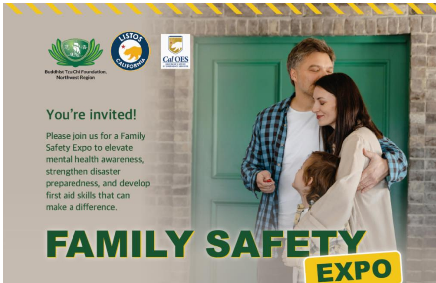
Family Safety Expo

Families are encouraged to join a variety of partners for the Family Safety Expo on April 21 from 10 a.m. to 4:30 p.m. at the Buddhist Tzu Chi Foundation, located at 2355 Oakland Road in San Jose. Topics covered include CPR, natural disaster preparedness, mental health awareness, and more.