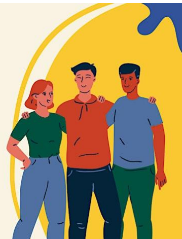
2024 Youth Leadership Summit: Student Wellness

The Santa Clara County Youth Task Force will host a Youth Leadership Summit on April 27 from 8:30 a.m. to 12 p.m. at Oak Grove High School. The goal is to uplift youth voices and strengthen youth leadership and engagement.