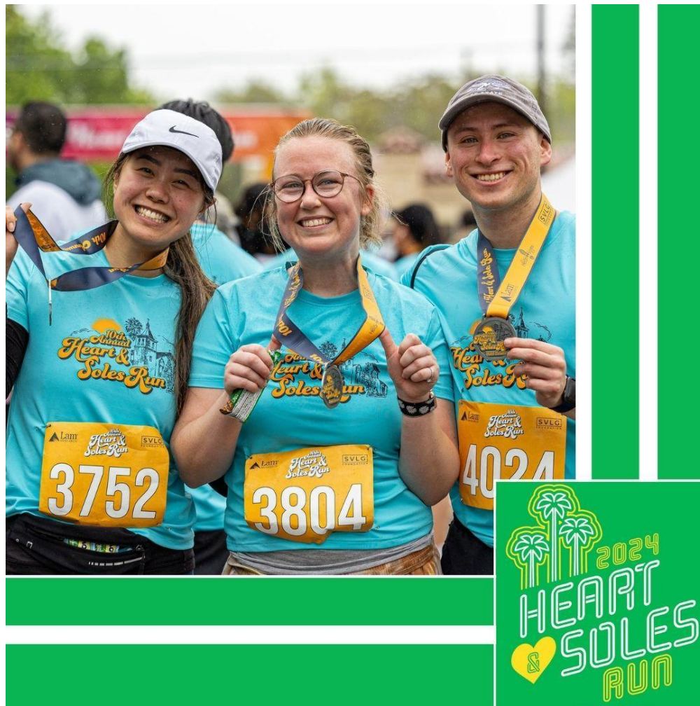
Heart and Soles Run

Looking for an opportunity to give back to the community this spring? Sign up to volunteer for the 11th Annual Lam Research Heart and Soles Run! To learn more or register, visit: https://runsignup.com/Race/Volunteer/CA/SantaClara/HeartandSolesRun