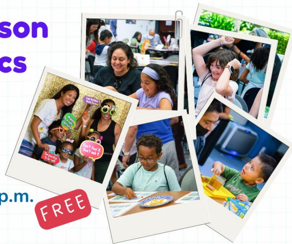
Julia Robinson Mathematics Festival

Join the SCCOE on April 20 for the Julia Robinson Mathematics Festival from 11 a.m. to 2 p.m. at 1290 Ridder Park Drive, San Jose, CA. Students in grades K-8 are encouraged to join and discover the fun and joy in mathematics by playing games, and solving puzzles with family and friends!