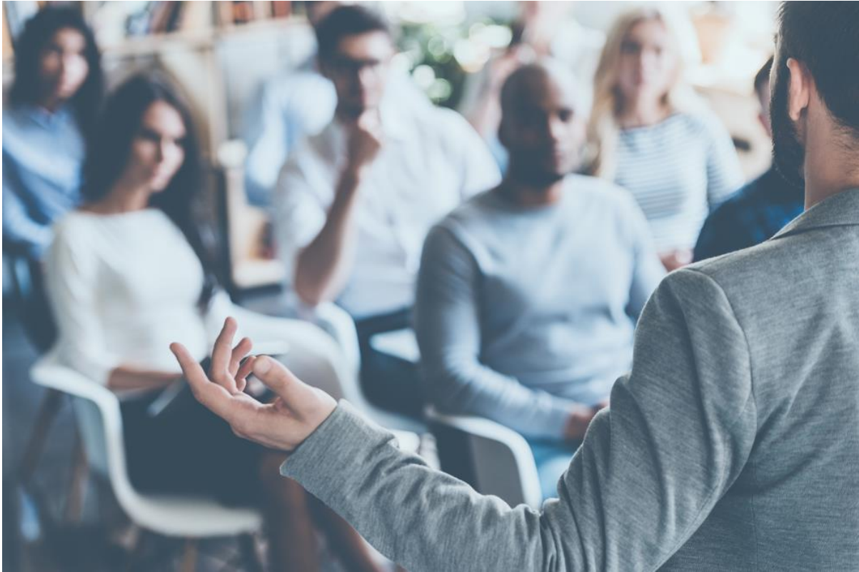
SCCOE Mental Health First Aid Trainings

The Santa Clara County Office of Education is hosting two Mental Health First Aid Trainings. This training will provide attendees with the skills to assist someone experiencing a mental health or substance use-related crisis. These trainings will be April 29-30 and May 22-23.