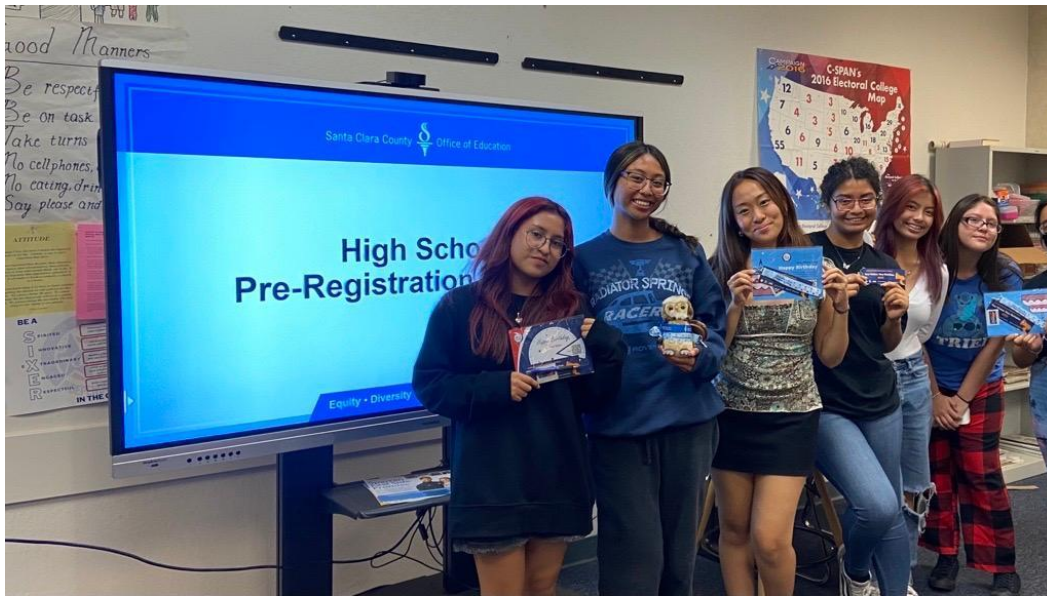
High School Voter Education Weeks

During High School Voter Education Weeks, April 15-26, the Santa Clara County Office of Education (SCCOE) in partnership with the County of Santa Clara Registrar of Voters (ROV), the League of Women Voters (LWV), and the American Association of University Women (AAUW) San Jose, is offering presentations on voter pre-registration, and the opportunity to host a voter registration drive on high school campuses. If you would like to sign up your school up for this opportunity, please fill out the Google form: https://sccoe.to/VoterEducationSchoolSignUp