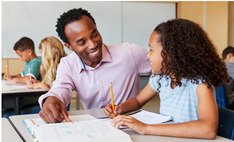
Male Educators of Color Initiative

To learn more or register, visit: https://airtable.com/app6QMkZ1XVQou2ta/paggWHDNbk9afVGnp/form