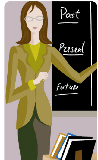
Some approaches to ELD instruction have overlooked oral language development as the foundation of written language.