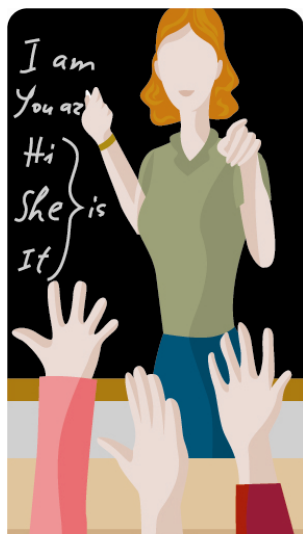
Older students often receive less oral language instruction because the emphasis is on reading, writing, and content.

Early Intermediate levels tend to engage in more listening and/or speaking activities, while reading and writing activities consume a greater portion of instructional time in classrooms where English learners are at the Intermediate level and higher. Other factors that influence the instructional time dedicated to oral language instruction include the teacher's education and training in second language teaching, and confidence with oral language activities; class size; and the district's and/or state's English language proficiency (ELP) standards.