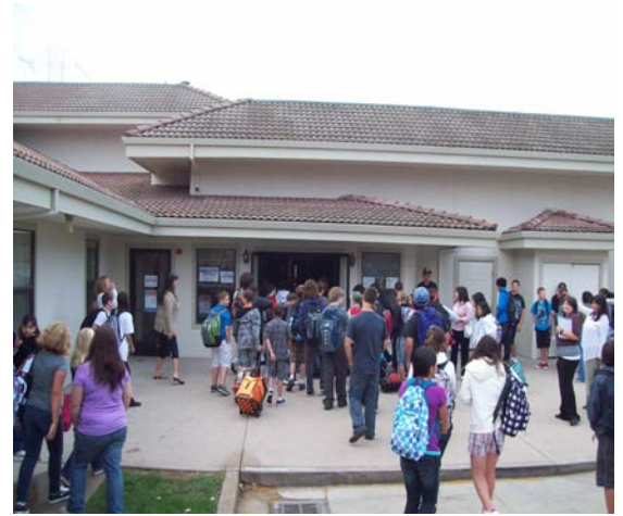
305 W. Main Ave. (Temporary) Morgan Hill, CA 95037