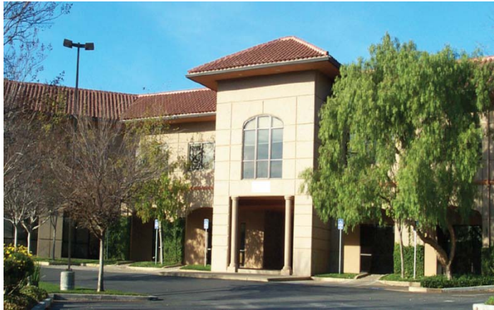
610 Jarvis Drive (Permanent Location) Morgan Hill, CA 95037