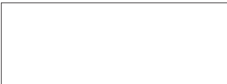
2260 .87 x 2.36